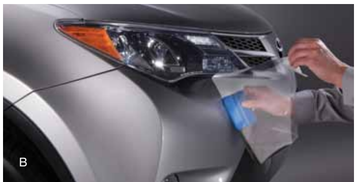
See footnote 1 in disclosure section on back cover.