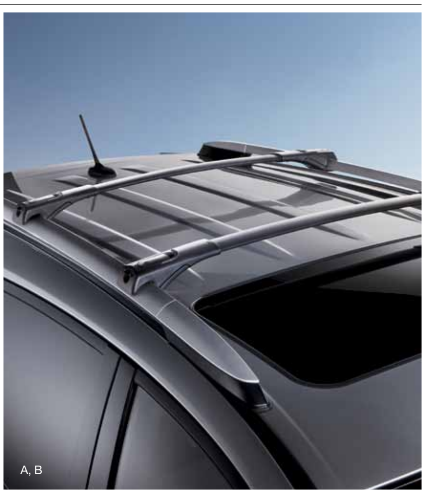
See footnotes 2, 3, 4 and 5 in disclosure section on back cover.