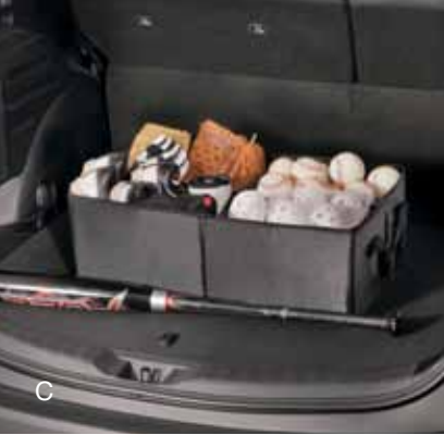
See footnotes 7, 8 and 9 in disclosure section on back cover