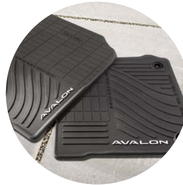
All-weather floor mats 3