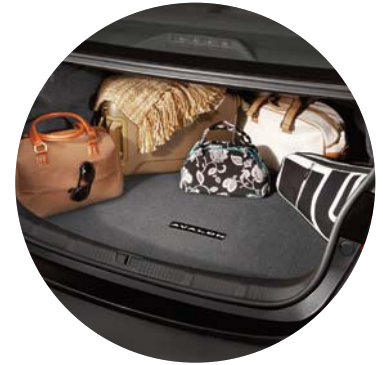
Carpet trunk mat 2