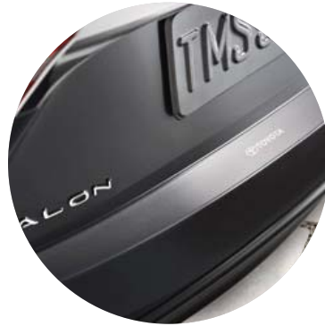
Rear bumper appliqué