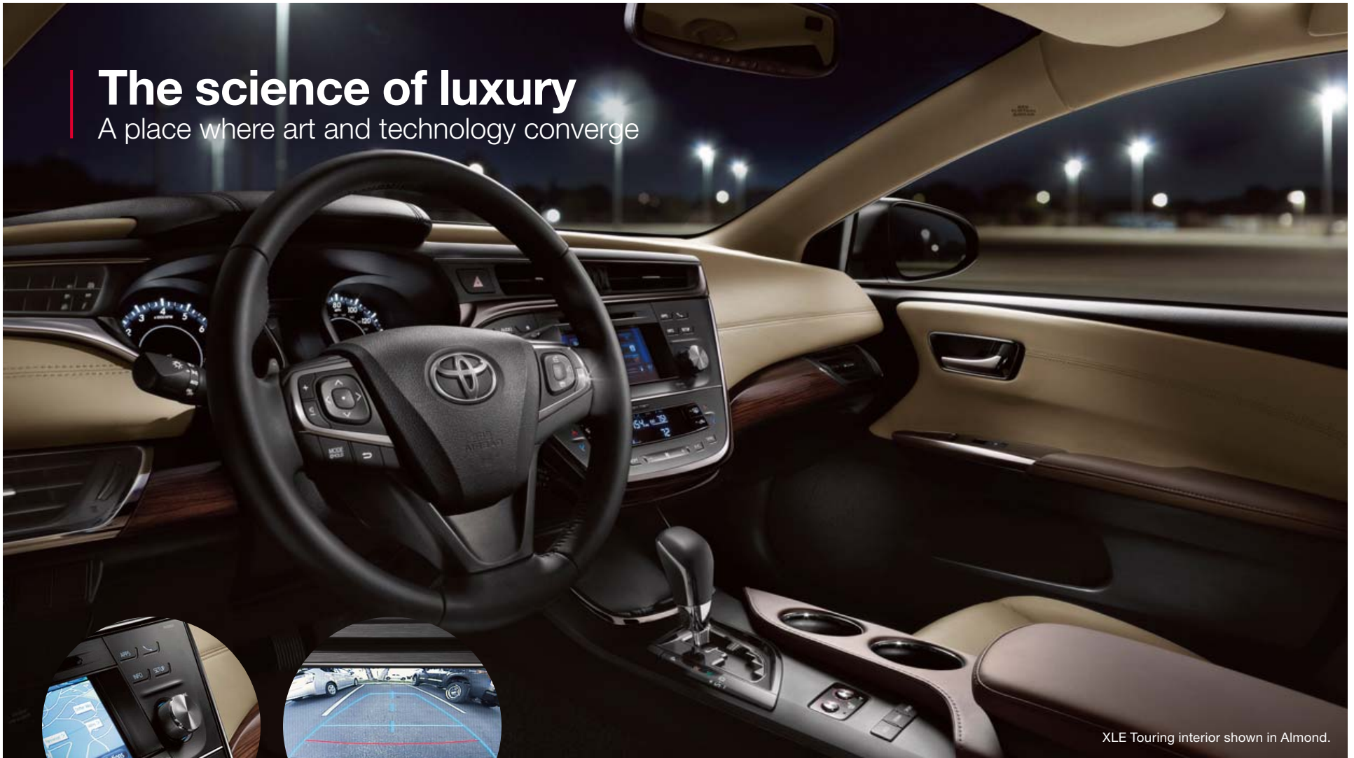
XLE Touring interior shown in Almond.

A place where art and technology converge