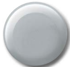
Classic Silver Metallic