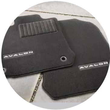
Carpet floor mats 3