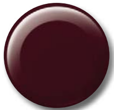
Sizzling Crimson Mica