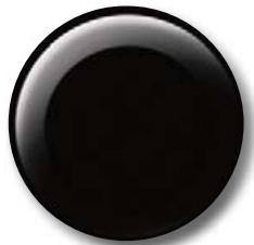
Attitude Black Metallic