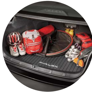
Cargo tray 2