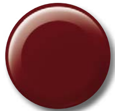
Ooh La La Rouge Mica