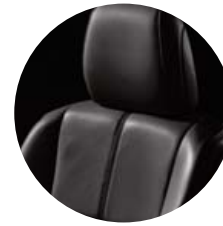
Black leather trim