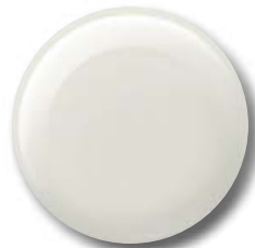
Blizzard Pearl Extra-cost color