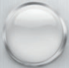
SNOW WHITE PEARL (LX, EX, SX, SXL) YOU HAVE A PURE HEART AND GENTLE NATURE. YOU LOVE LONG NAPS.