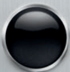
EBONY BLACK (L, LX, EX, SX, SXL) YOU ARE NOT AFRAID OF THE DARK, NOR OF PLAYING THE PIANO IN FRONT OF A CROWD.