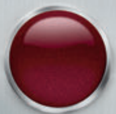
PASSION RED (LX, EX, SX)^ YOU CRAVE EXCITEMENT AND SEE LIFE MORE VIVIDLY THAN THE AVERAGE PERSON.