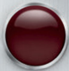
SANGRIA (LX, EX, SX) YOU'RE A FAN OF FESTIVE BEVERAGES AND MOVIES WITH MATADORS IN THEM.