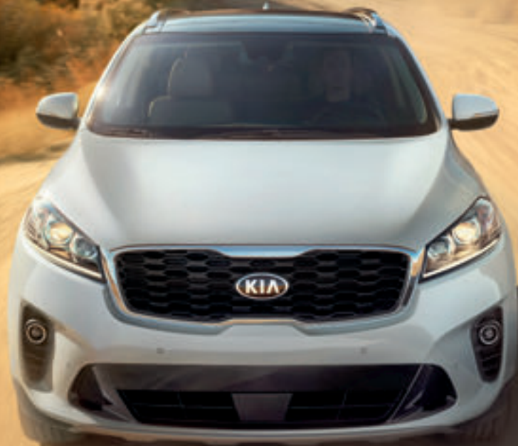
EX W/TOURING PACKAGE SHOWN

Start here to explore the key features and options of Sorento's first three trim choices. Or turn the page to head straight for the higher trim levels.