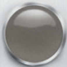
TITANIUM SILVER (L, LX, EX, SX, SXL) YOUR STRENGTH OF CHARACTER IS PERFECTLY BALANCED BY YOUR FONDNESS FOR SHINY OBJECTS.