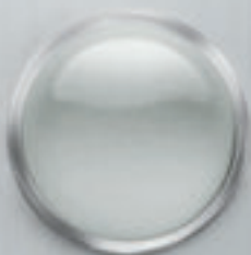
SPARKLING SILVER (L, LX, EX) YOU'VE LEARNED ALL THAT GLITTERS IS NOT GOLD, AND THAT'S THE WAY YOU LIKE IT.