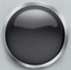
PLATINUM GRAPHITE (LX, EX, SX, SXL) YOU VIEW AN OVERCAST DAY AS AN OPPORTUNITY TO WEAR YOUR FAVORITE SWEATSHIRT.