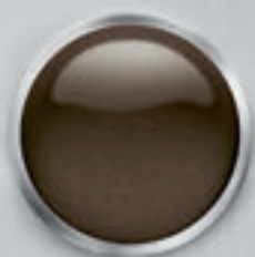
DRAGON BROWN (LX, EX, SX, SXL) THOUGH DOWN-TO-EARTH, YOU ARE ALSO KNOWN TO HAVE A FIERY PERSONALITY.