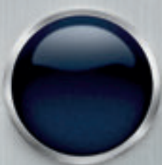
BLAZE BLUE (LX, EX, SX)^ YOU PLAY IT COOL, THOUGH YOUR FRIENDS ARE WELL ACQUAINTED WITH YOUR WILD STREAK.