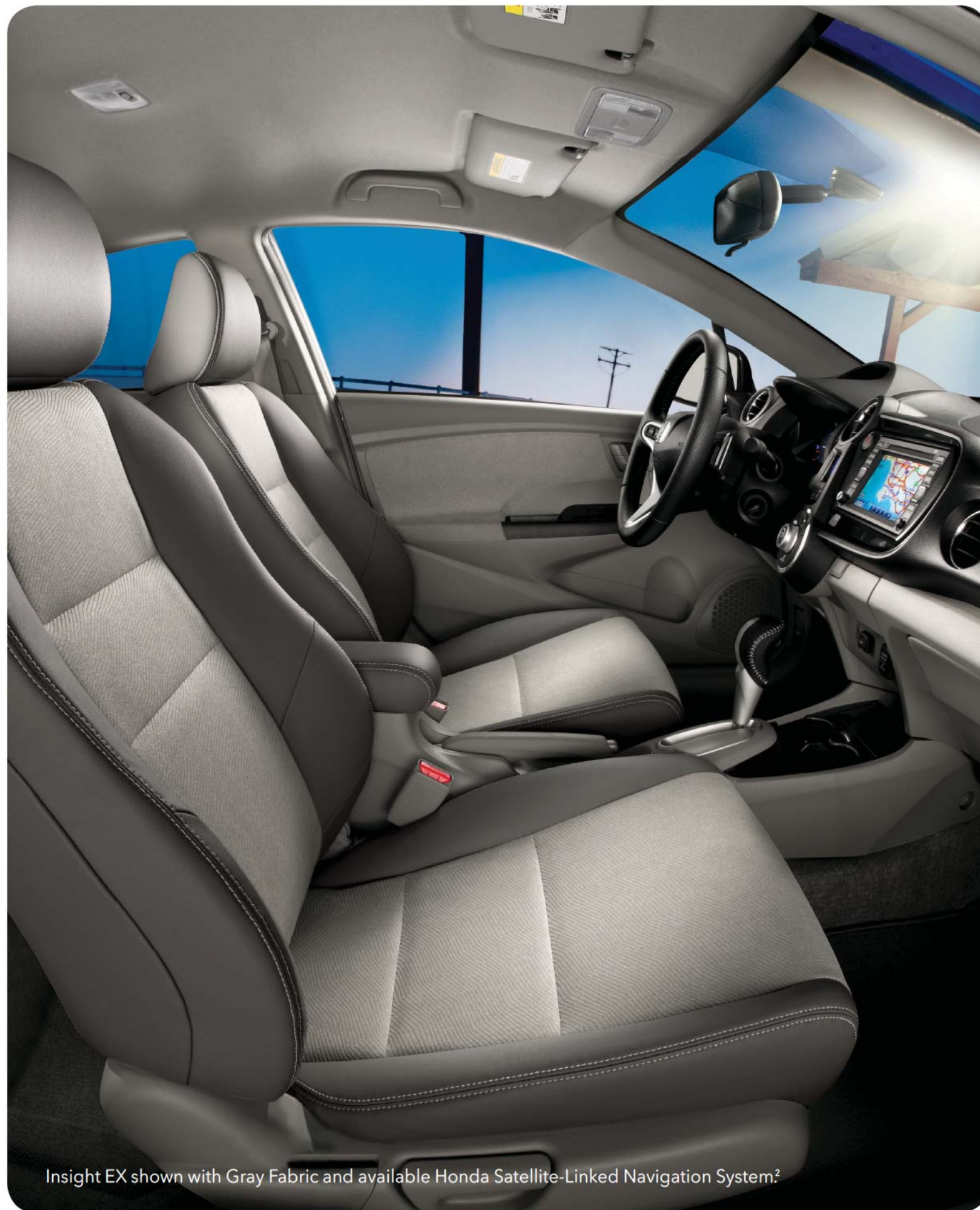
Insight EX shown with Gray Fabric and available Honda Satellite-Linked Navigation System 2