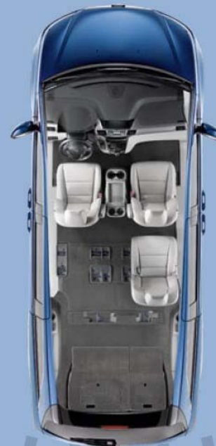
Even with 3 passengers, there's still plenty of room for a surfboard or ladder.