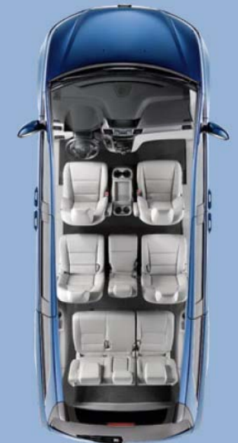
More space for passengers, or more room for two child seats in the second row in "wide mode."*