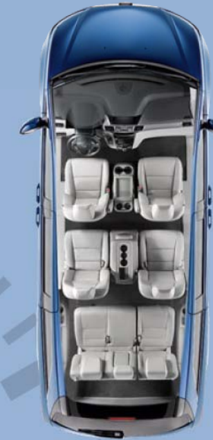
7 passengers, 1 stylish ride.*