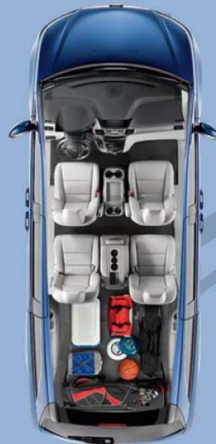
Party of 4? Stow the 3rd row for more cargo space.*