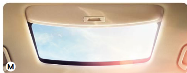
M One-Touch Power Moonroof The moonroof's tilt setting and one-touch control give you a simple way to brighten your day. (EX-L and above)