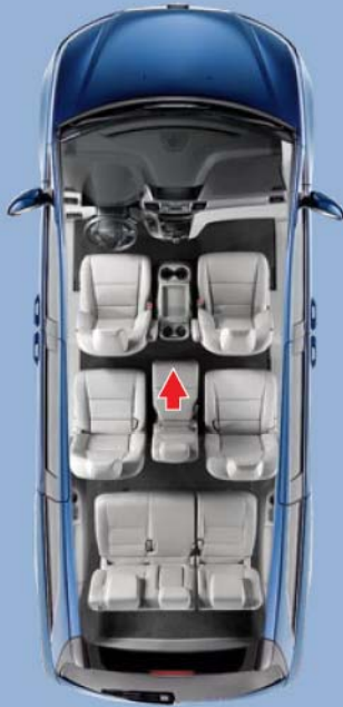
Quite possibly the perfect combination of cargo and passenger space.*

Where there's a will, the Odyssey has a way. Configure the interior to transport 8 adults (EX and above), 4' x 8' sheets of plywood and everything in between.