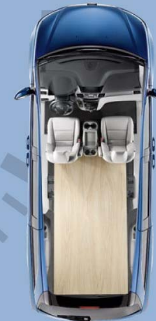
Build a tree house. Or a real house. Hauling lumber is a breeze.