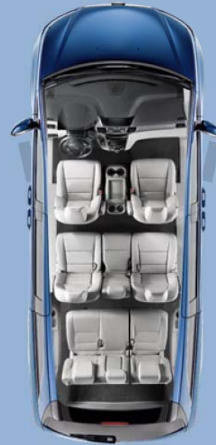
Who's got room for 8? You do.*