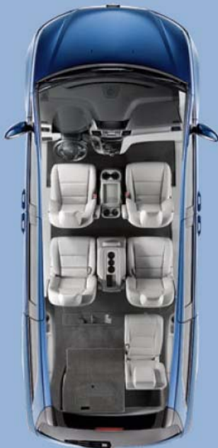
5 passengers and lots of cargo space left to fill.*