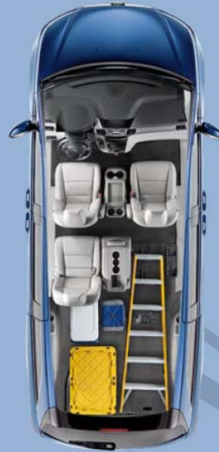
The versatile interior lets you move a ton of stuff. And bring two friends to help.*