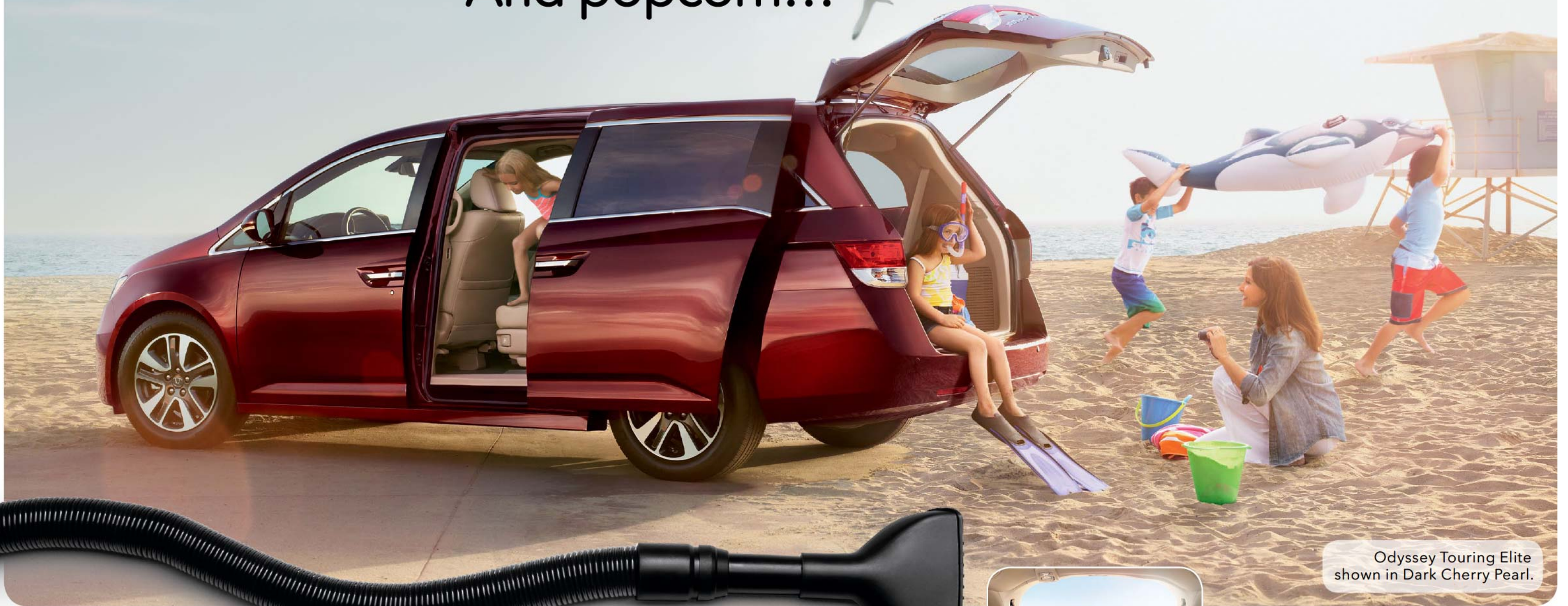
Odyssey Touring Elite shown in Dark Cherry Pearl.