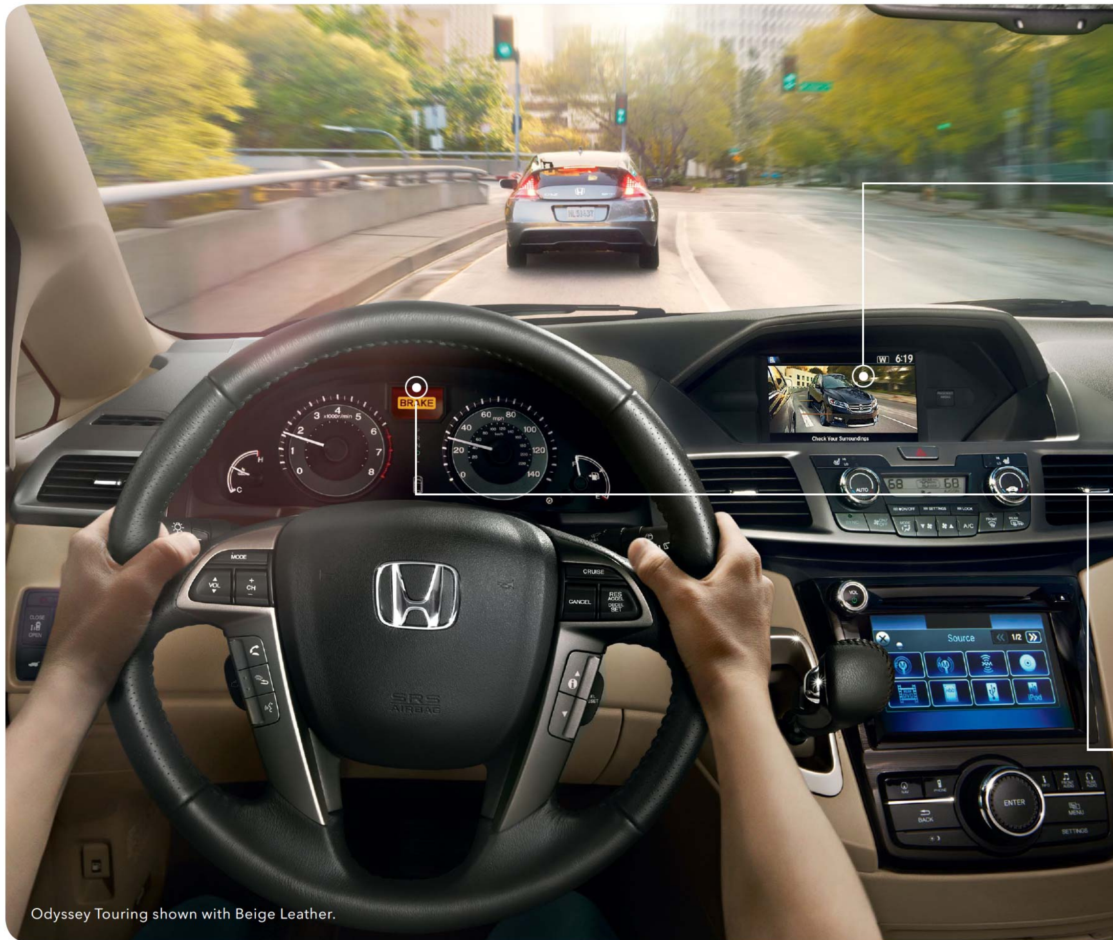
Odyssey Touring shown with Beige Leather.