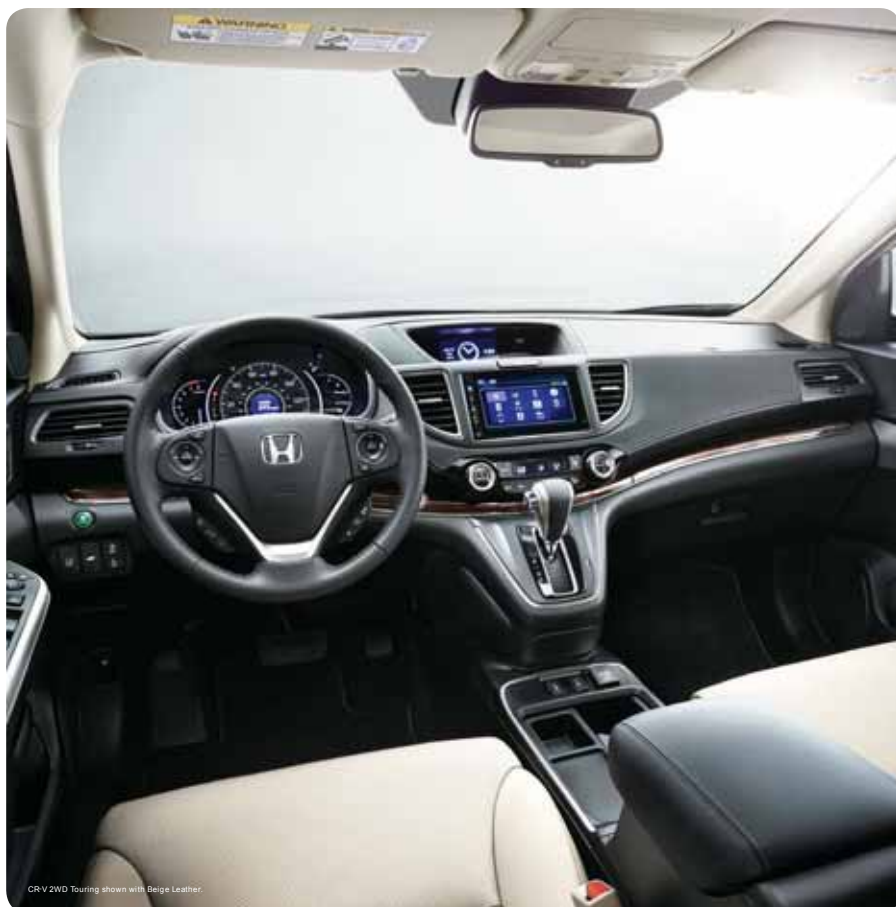
CR-V 2WD Touring shown with Beige Leather.

CR-V 2WD Touring shown in Modern Steel Metallic.