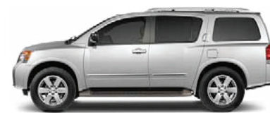
PLATINUM: THE COMPLETE EXPERIENCE