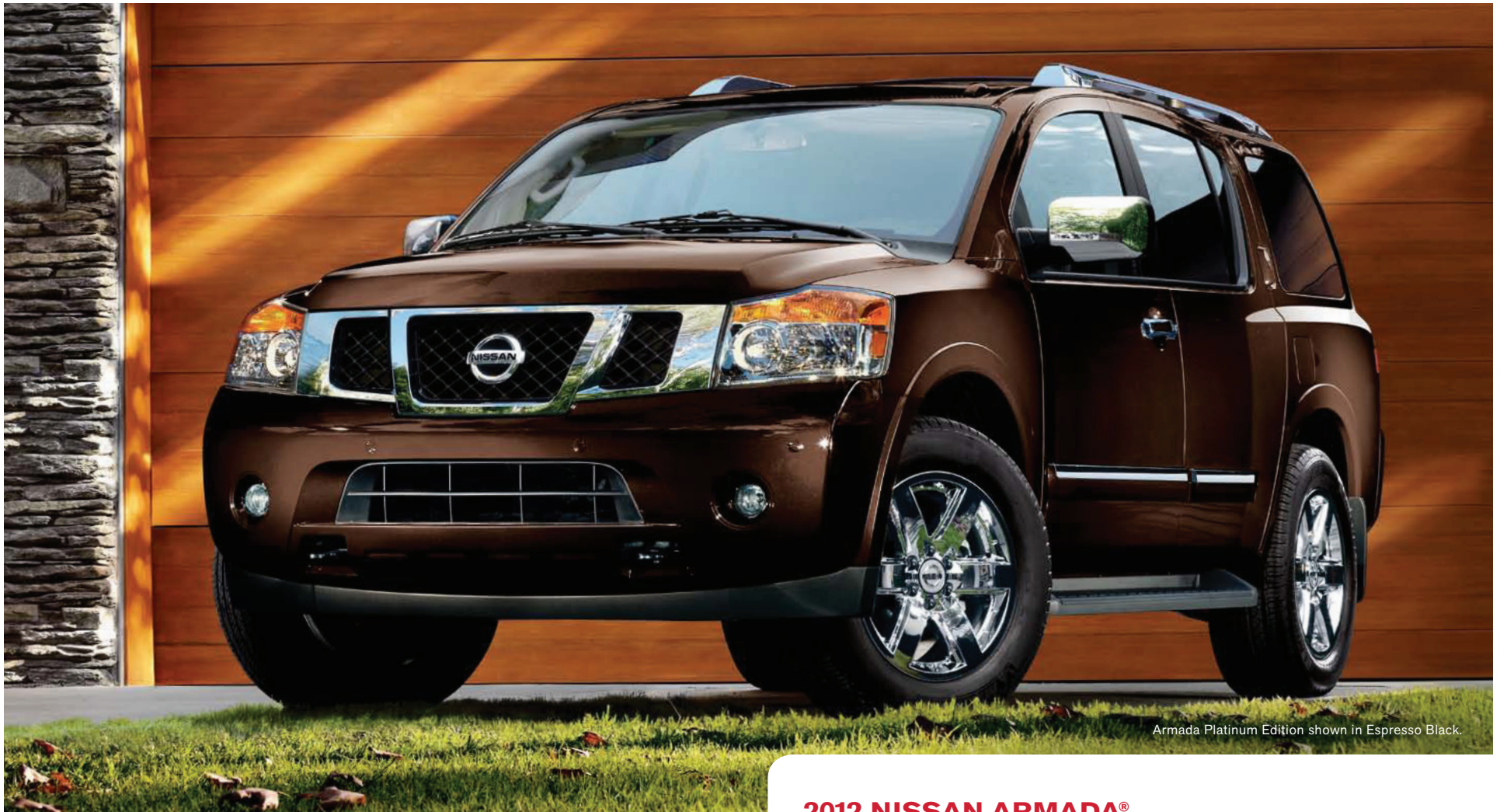
Armada Platinum Edition shown in Espresso Black.