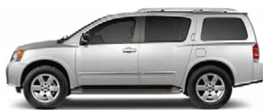
SL: BRING ON THE WORLD