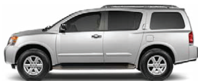
SV: LET THE ADVENTURE BEGIN