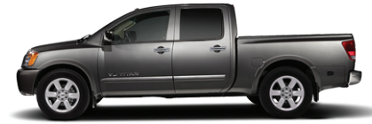
SL CREW CAB