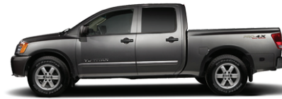
PRO-4X KING CAB AND CREW CAB