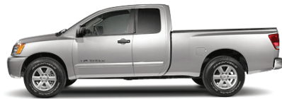
SV KING CAB AND CREW CAB