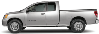
S KING CAB AND CREW CAB