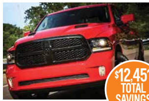
2017 RAM 1500 CREW CAB