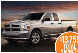
2017 RAM 1500 QUAD CAB

SEVERAL TO CHOOSE. MSRP $27,740. REBATE $4,500, LITHIA DISCOUNT $3,741, PRICE $19,499 PLUS TT&L AND FEES. $2,000 DOWN PLUS TT&L & FEES. 84 MONTHS AT 3.99% APR WITH APPROVED CREDIT. OFFER EXPIRES 3/31/2017.