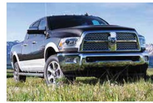
2017 RAM 3500

SALE PRICE $46,315 $14,750 TOTAL SAVINGS OFF MSRP!