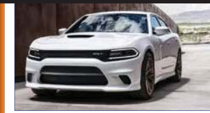
NEW 2015 DODGE CHARGER

STK#FB367268. MSRP $26,975. LITHIA DISCOUNT $8,976, PRICE $17,999 PLUS TT&L AND FEES. $2,000 DOWN PLUS TT&L AND FEES. 84 MONTHS AT 3.99% APR WITH APPROVED CREDIT. OFFER EXPIRES 3/31/2017.