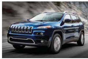
2017 JEEP CHEROKEE

SAVE THOUSANDS ON HUNDREDS OF VEHICLES IN STOCK!