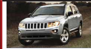
NEW 2015 JEEP COMPASS

TWO 2015s LEFT MUST GO! GREAT DEALS AND SAVINGS!