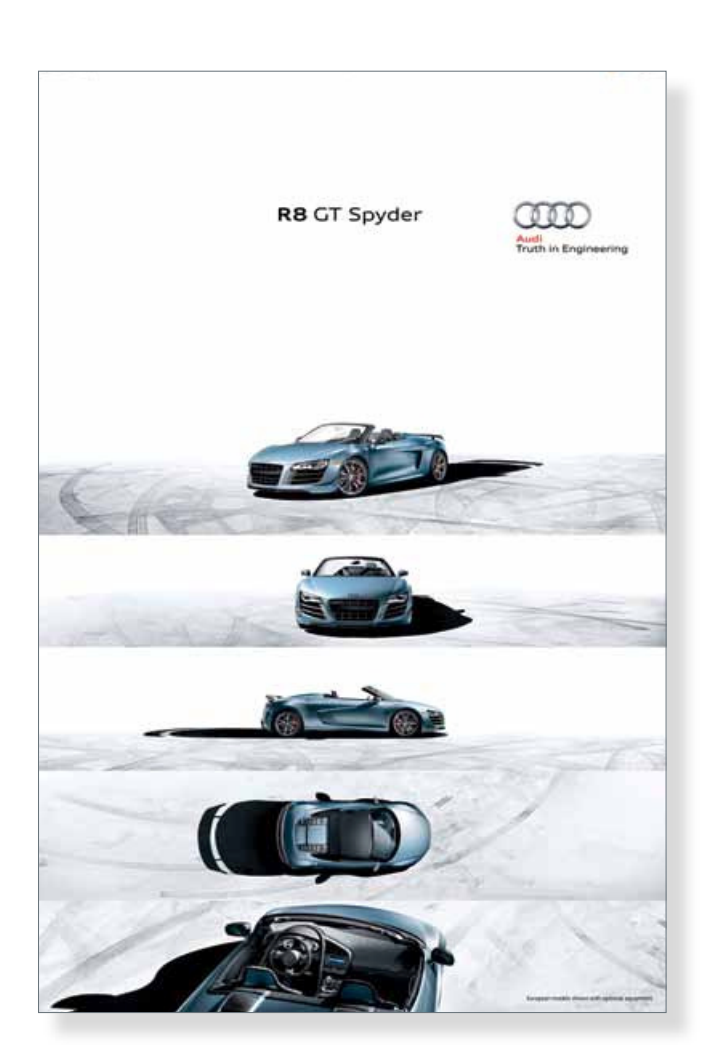
R8 GT SPYDER POSTER