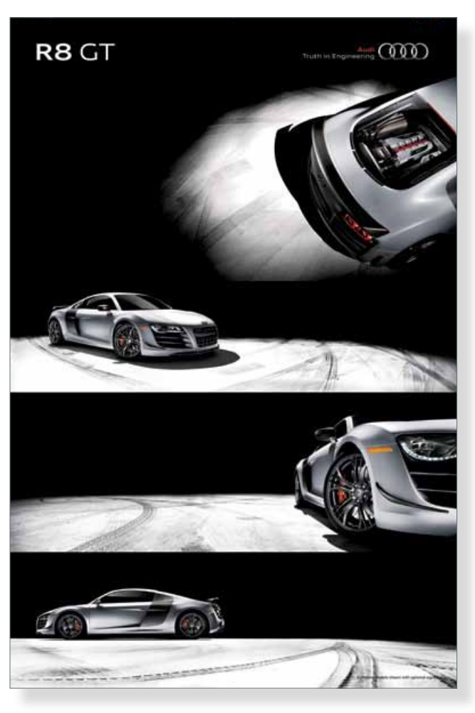
R8 GT POSTER