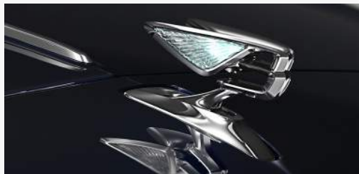
PAINTS DARK SAPPHIRE