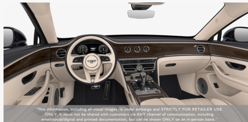
COLOUR SPLIT COLOUR SPLIT - A

"This information, including all visual images, is under embargo and STRICTLY FOR RETAILER USE ONLY. It must not be shared with customers via ANY channel of communication, including email/social/digital and printed documentation, but can be shown ONLY on an in-person basis."