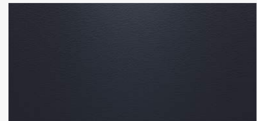
SECONDARY HIDE IMPERIAL BLUE

"This information, including all visual images, is under embargo and STRICTLY FOR RETAILER USE ONLY. It must not be shared with customers via ANY channel of communication, including email/social/digital and printed documentation, but can be shown ONLY on an in-person basis."