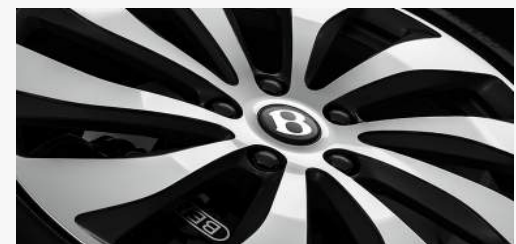
WHEELS 22" TEN SPOKE WHEEL - BLACK PAINTED AND BRIGHT MACHINED

"This information, including all visual images, is under embargo and STRICTLY FOR RETAILER USE ONLY. It must not be shared with customers via ANY channel of communication, including email/social/digital and printed documentation, but can be shown ONLY on an in-person basis."