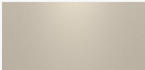
MAIN HIDE LINEN