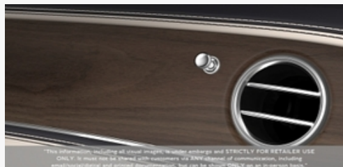
OPEN PORE CROWN CUT WALNUT

"This information, including all visual images, is under embargo and STRICTLY FOR RETAILER USE ONLY. It must not be shared with customers via ANY channel of communication, including email/social/digital and printed documentation, but can be shown ONLY on an in-person basis."