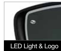
LED Light & Logo

* Requires Interior Auto-Dimming Mirror.