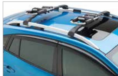
J-style carrier folds down when not in use.