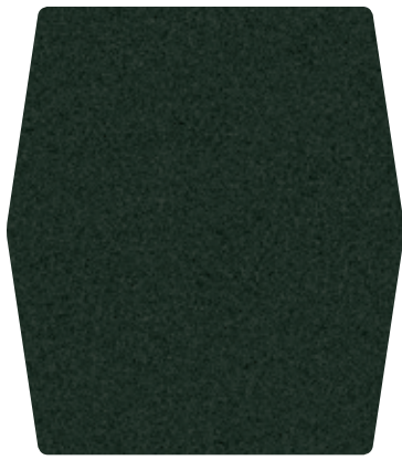
2. Guard Metallic