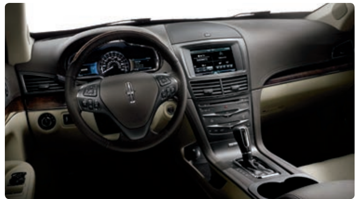
Light Dune Leather