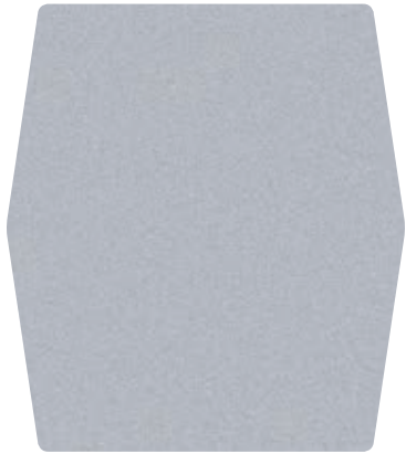
3. Ingot Silver Metallic