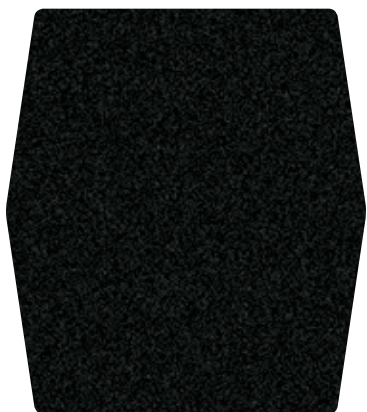
7. Tuxedo Black Metallic