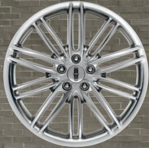
20" Polished Aluminum Available on EcoBoost®