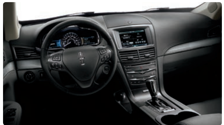
Charcoal Black Leather