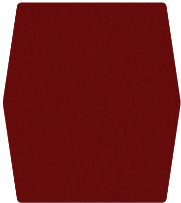
5. Bronze Fire Metallic Tinted Clearcoat 1