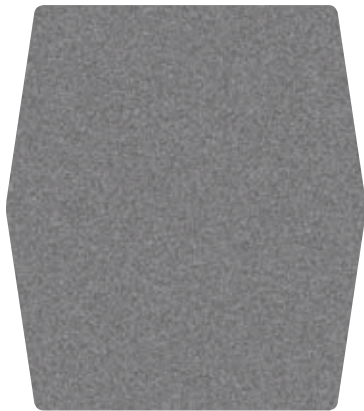
6. Luxe Metallic