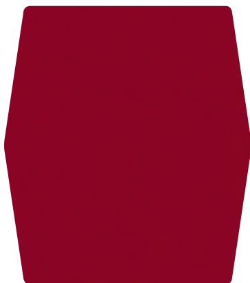
8. Ruby Red Metallic Tinted Clearcoat 1