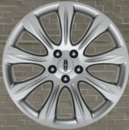
19" Premium Painted Aluminum Standard