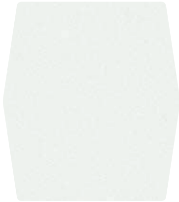
4. White Platinum Metallic Tri-coat 1