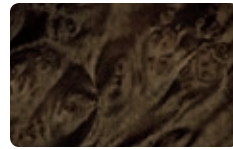
Prussian Burl Wood

Available with exterior colors 2, 3, 4, 5, 6, 7