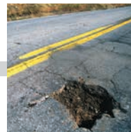
POTHOLES/ DAMAGED PAVEMENT

**Tire must have more than 3/32" tread depth remaining at time of repair.