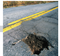
POTHOLES/ DAMAGED PAVEMENT

**Tire must have more than 3/32" tread depth remaining at time of repair.