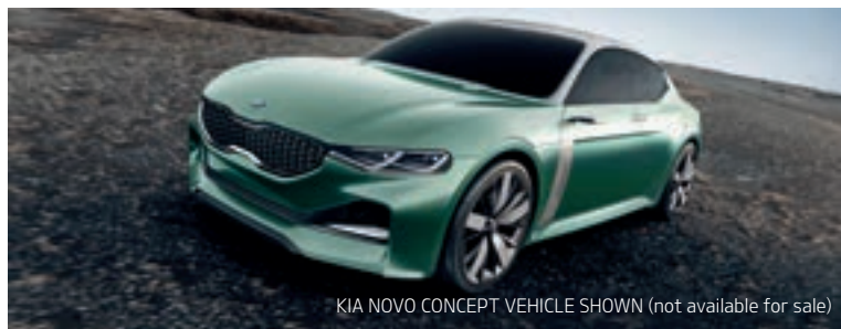
KIA NOVO CONCEPT VEHICLE SHOWN (not available for sale)