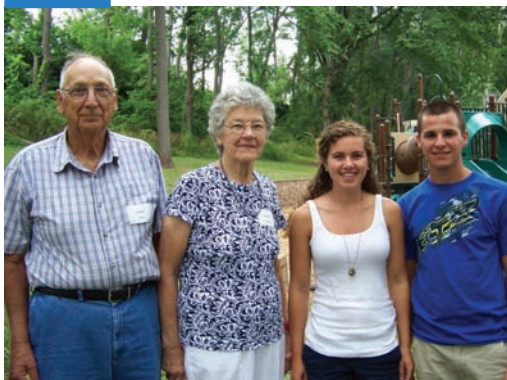
1st place winners