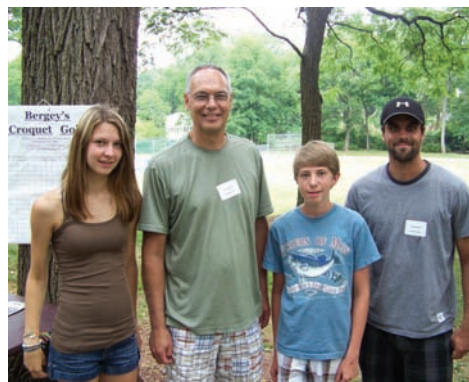
2nd place winners