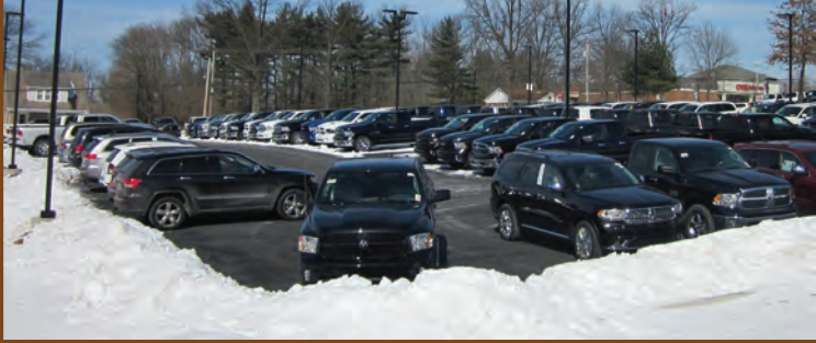
Completed CJD parking area