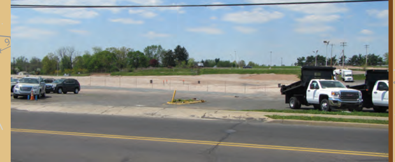
Stages of removal of building and clearing of site for new Franconia building