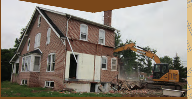
Removal of house to clear ground for CJD parking lot