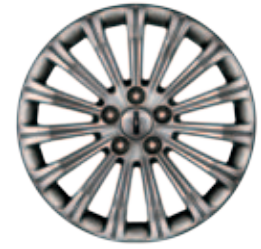
18" Premium Painted Aluminum Standard

Voice-activated Navigation System with SD card for map and POI storage; integrated SiriusXM Traffic and Travel Link with 6-month trial subscription (includes THX II Certified Audio System and HD Radio Technology) 9