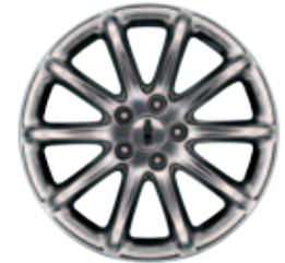
18" Polished Aluminum Included with Premium Package