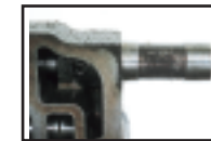
Valve body spool with heavy deposit build-up.

One of the hardest working parts of your vehicle will shift smoothly and effortlessly for many more trouble-free miles.