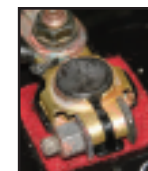
Battery terminal after BG Battery Service