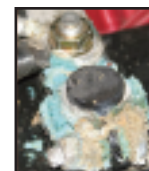
Battery terminal with corrosion build-up

Solution: A battery cleaner and leak detector is applied after a thorough cleaning and inspection. Anti-corrosion BG Battery Terminal Protectors are installed and the battery posts, terminals and case are sealed. Severe cases may require terminal replacement.