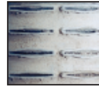
Rust, scale & sludge can plug cooling system fins, preventing proper circulation of coolant.

Solution: The entire cooling system is first cleaned and then all debris and worn out coolant is completely flushed from the system. Fresh premium coolant is added together with conditioners to prevent rust and corrosion. BG Cooling System Sealer is also included to prevent leaks. Your heater core and water pump will be protected and last longer while your engine will run cooler in extreme temperatures.