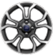
17" PAINTED MACHINED ALUMINUM Standard

OPTIONS Cargo Management Package Interior Protection Package SES Black Appearance Package: black hood decal, black-painted roof and black spoiler (available with Lightning Blue, Diamond White and Moondust Silver exterior colors) Engine block heater Front and rear molded splash guards Keyless-entry keypad Remote Start System