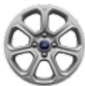
16" SHADOW SILVER-PAINTED ALUMINUM Standard

1.0L ECOBOOST® WITH AUTO START-STOP TECHNOLOGY 6-SPEED SELECTSHIFT® AUTOMATIC TRANSMISSION