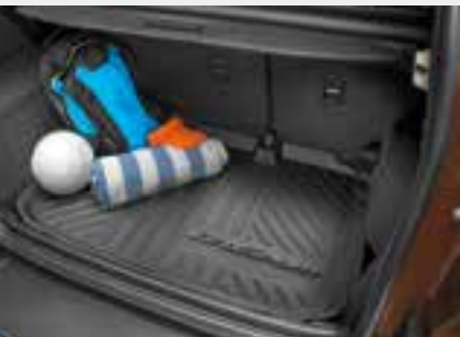
Cargo area protector

Titanium in Ruby Red Metallic Tinted Clearcoat accessorized with hood deflector, side window deflectors, 1 front and rear molded splash guards, keyless entry keypad, roof crossbars, 1 roof-mounted bike carrier, 1,2 and wheel lock kit