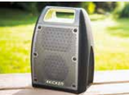
Portable Bluetooth® speaker