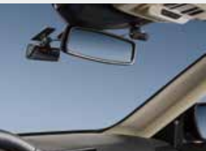
Dash cam systems 1

SHOP THE COMPLETE COLLECTION | accessories.ford.com