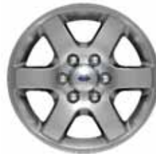
17" Aluminum Optional