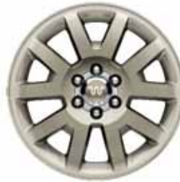
20" Premium Painted Aluminum with King Ranch Center Caps Optional