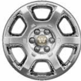
20" Chrome-Clad Aluminum with King Ranch Center Caps Optional