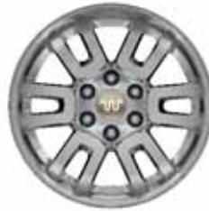
18" Machined Aluminum with King Ranch Center Caps Standard