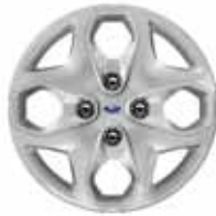
15" Steel with Silver-Painted Covers Standard