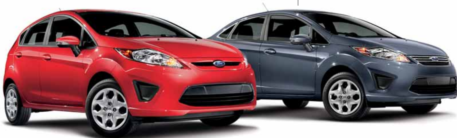
Hatchback. Race Red. Sedan. Violet Gray Metallic.