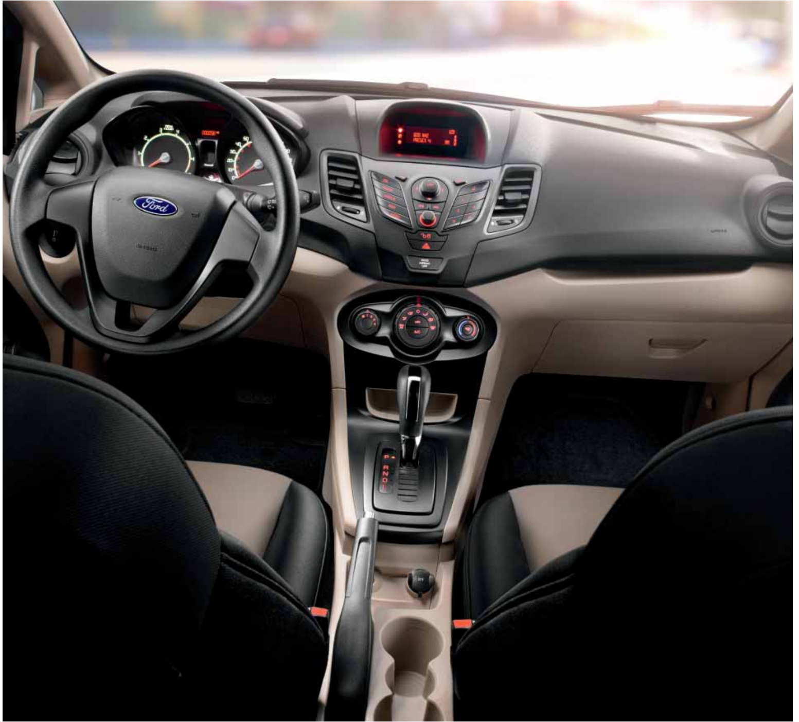
Charcoal Black cloth trim. Light Stone inserts. Available equipment. | Sedan luggage capacity (12.8 cu. ft.). | Door map pocket with cupholder. | Power door locks switch.