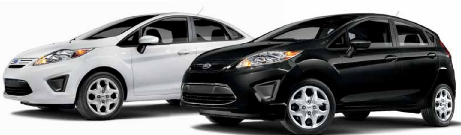
Sedan. Oxford White. Hatchback. Tuxedo Black Metallic.

PowerShift 6-speed automatic transmission (late availability)