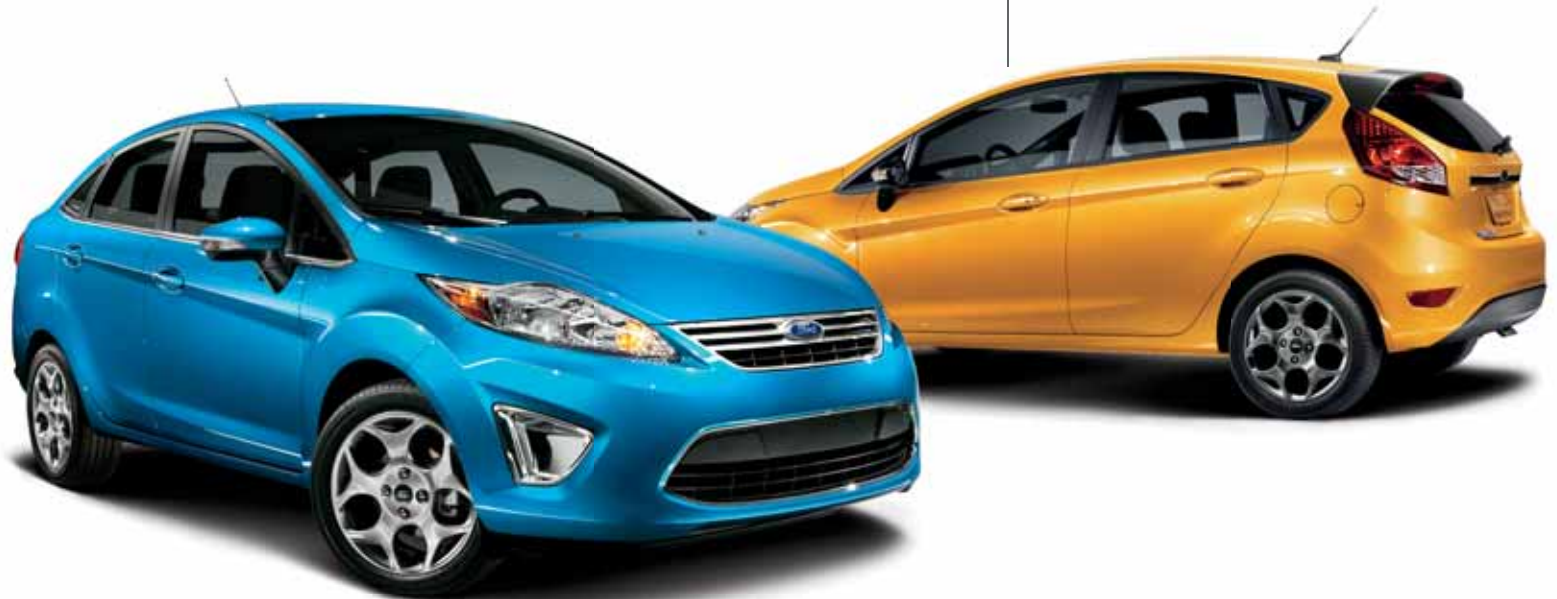
Sedan. Blue Candy Metallic Tinted Clearcoat. Hatchback. Yellow Blaze Metallic Tri-coat. Black Sport Appearance Package. Available equipment.