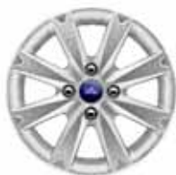
15" Painted Aluminum Included with SE Appearance Package