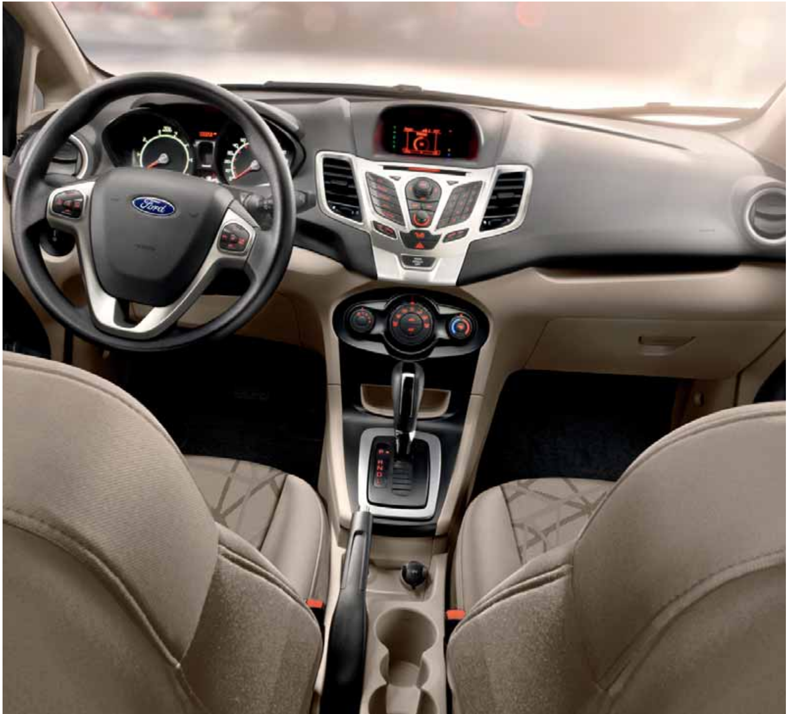
Unique Light Stone cloth trim. Light Stone inserts. Available equipment. | 5-speed manual transmission shift knob. | Easy Fuel® capless fuel filler. | Hatchback cargo volume (15.4 cu. ft.).