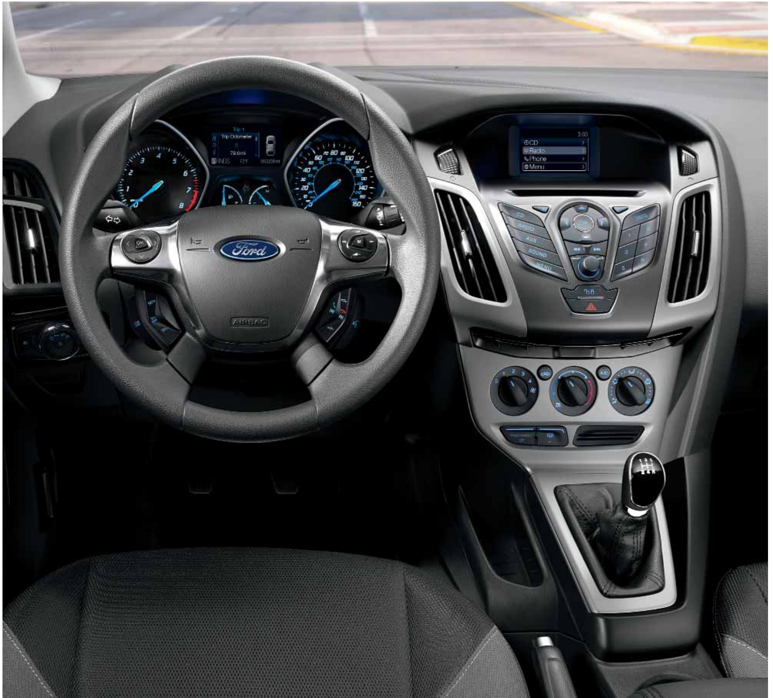
Warm Steel cloth trim. Charcoal Black inserts. Available equipment. | Tuscany Red Interior Style Package. 1 Available equipment. | Sedan. Rear spoiler. 1 Arctic White Interior Style Package. 1 Available equipment.