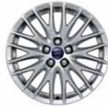
17" Sport Painted Aluminum Standard