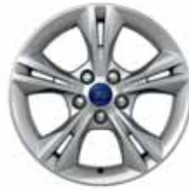
16" Painted Aluminum Standard