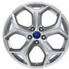
18" Y-Spoke Painted Aluminum Standard