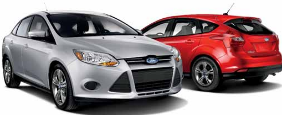
Sedan. Ingot Silver Metallic. Hatchback. Race Red. Available equipment.

Visit accessories.ford.com to shop the complete collection