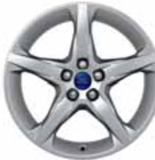
18" Painted Aluminum Included with Handling Package