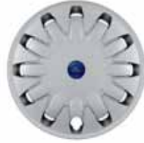
16" Steel with Unique Aero Silver-Painted Wheel Cover Included with SFE Package