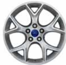
17" Silver Machined Aluminum Included with SE Appearance Package