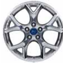
17" Polished Aluminum Optional