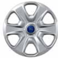
15" Steel with Silver-Painted Wheel Covers Standard

1 Warm Steel Cloth with Charcoal Black Inserts