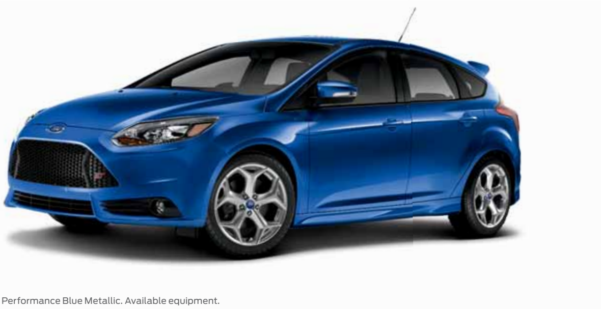
Performance Blue Metallic. Available equipment.

Visit accessories.ford.com to shop the complete collection