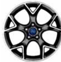
17" Black-Painted Machined Aluminum Included with SE Appearance Black Package