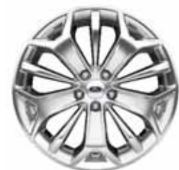
19" Premium Luster Nickel-Painted Aluminum Standard