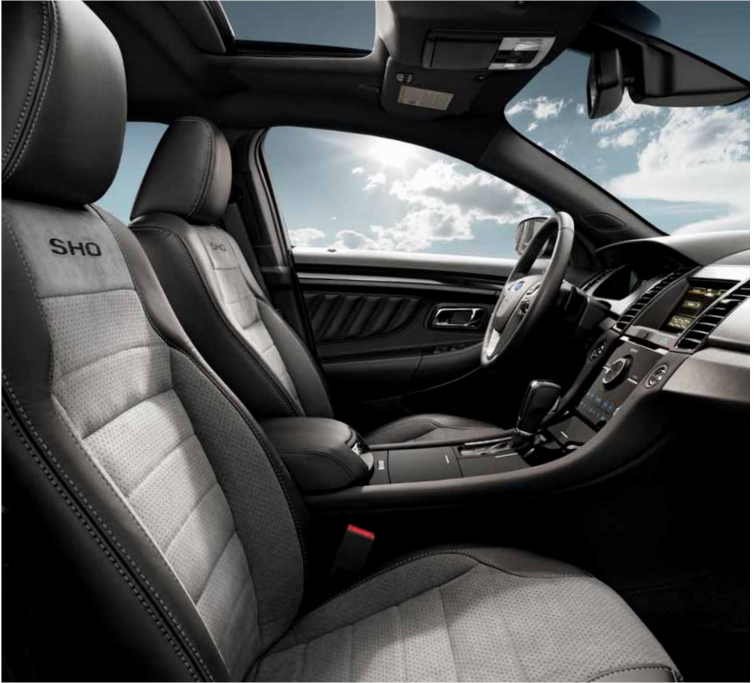
Charcoal Black leather trim with Mayan Gray Miko® Suede perforated inserts. Available equipment. | Charcoal Black leather trim with perforated inserts. | "SHO" engine cover. | EcoBoost® direct fuel injector. | Rear spoiler.