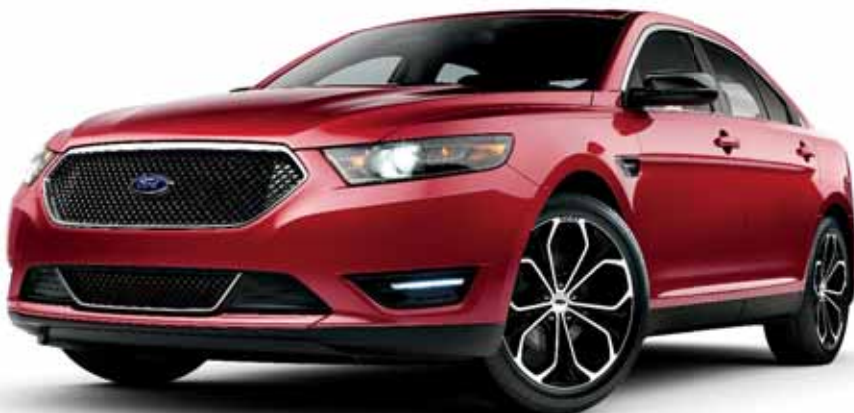
Ruby Red Metallic Tinted Clearcoat. Available equipment.

Visit accessories.ford.com to shop the complete collection