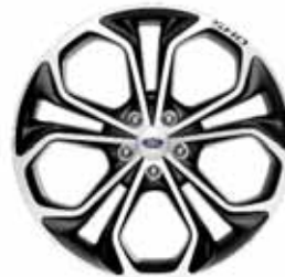
20" Machined and Painted Aluminum Available