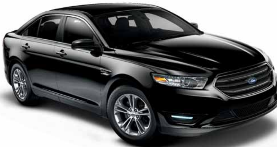
SEL. Tuxedo Black Metallic.

Visit accessories.ford.com to shop the complete collection