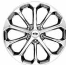
20" Polished Aluminum Available