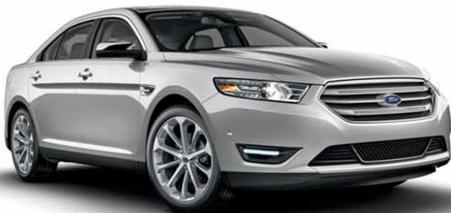
Ingot Silver Metallic. Available equipment.

Visit accessories.ford.com to shop the complete collection