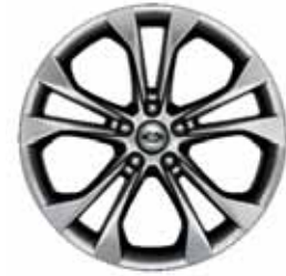
19" Premium Luster Nickel-Painted Aluminum Standard