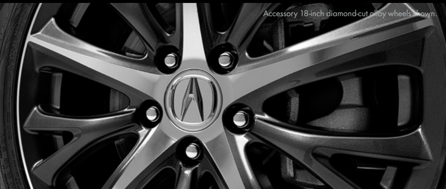
Accessory 18-inch diamond-cut alloy wheels shown.

The redesigned ILX comes with standard Jewel Eye LED headlights and LED taillights—an aggressive style to match the confidence you feel behind the wheel.