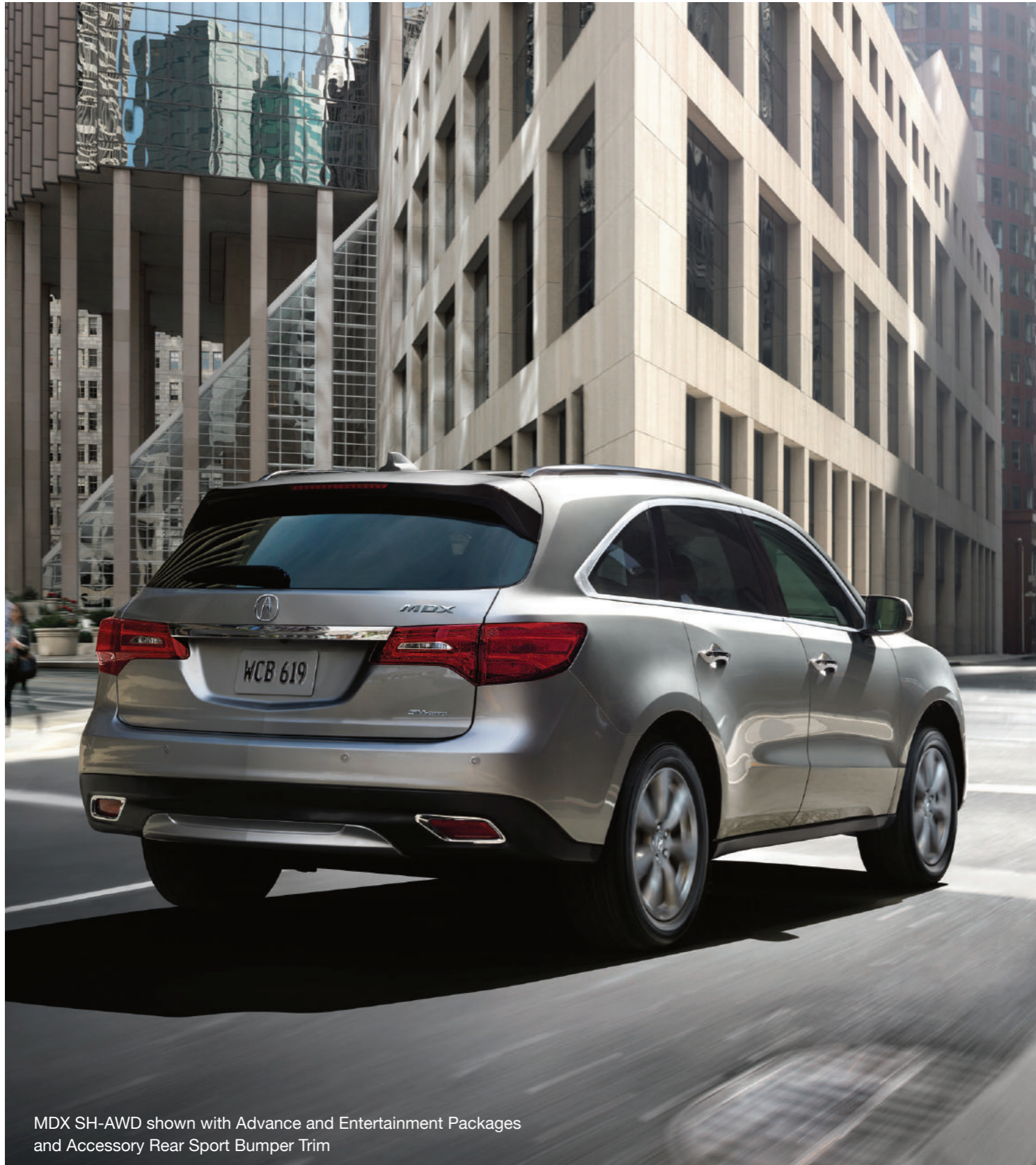
MDX SH-AWD shown with Advance and Entertainment Packages and Accessory Rear Sport Bumper Trim