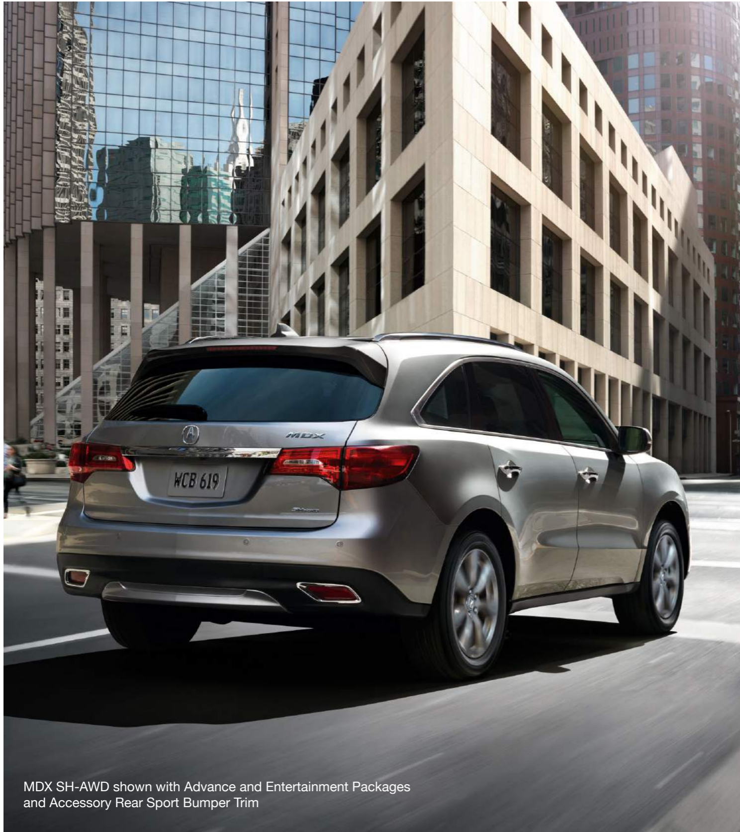
MDX SH-AWD shown with Advance and Entertainment Packages and Accessory Rear Sport Bumper Trim