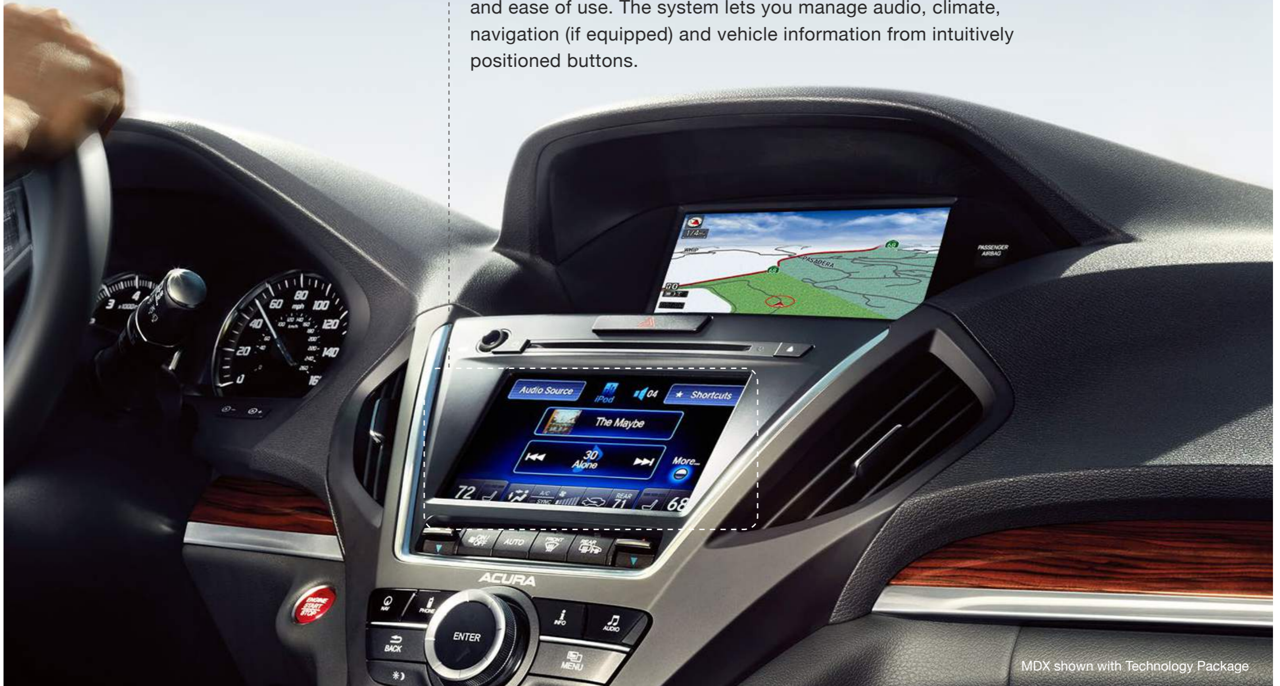
MDX shown with Technology Package

The Acura On Demand Multi-Use Display™ (ODMD™) is the definitive touch-screen interface. Featuring a hand-level screen that is separate from the eye-level display-only screen, the ODMD™ has been designed for even greater functionality and ease of use. The system lets you manage audio, climate, navigation (if equipped) and vehicle information from intuitively positioned buttons.