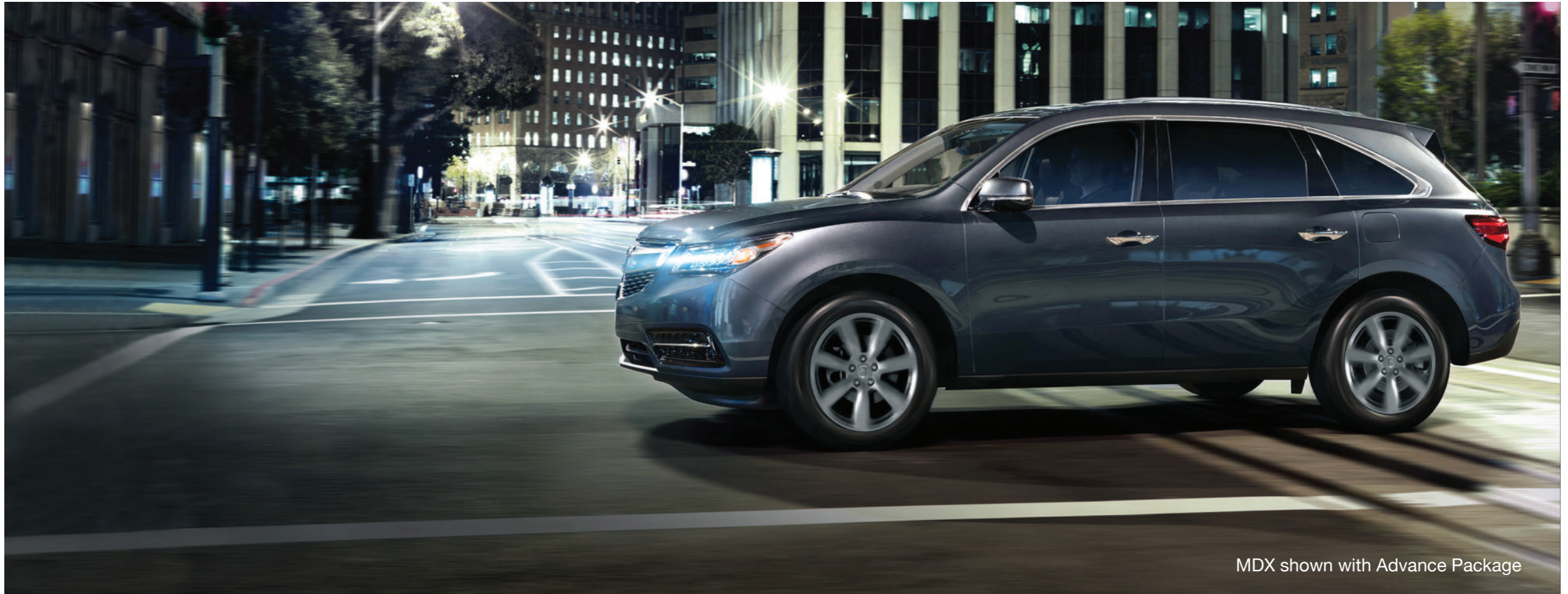
MDX shown with Advance Package