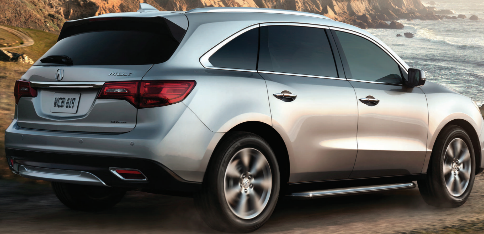
MDX SH-AWD shown with Advance and Entertainment Packages, Accessory Rear Sport Bumper Trim and Advance Running Boards