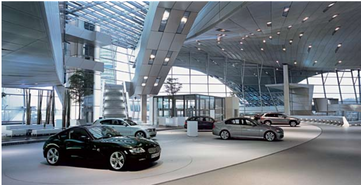
Individual automobile presentation on the turntables of the “Premiere.”

Now is the great moment. In the spacious atmosphere of the BMW Welt, your new BMW will be presented to you. Your personal attendant will accompany you, will brief you on the car, and will be available to answer all your questions.