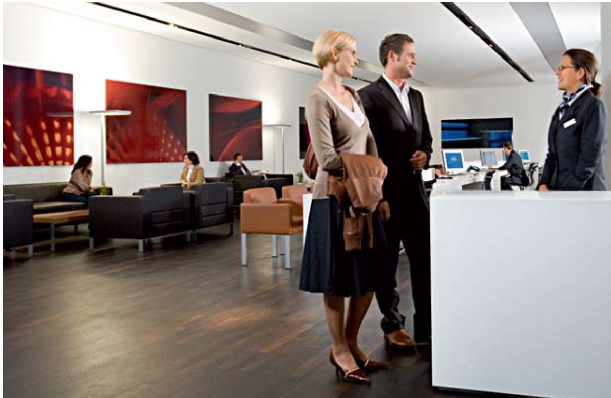
Personal welcome at the Check-In counter in the Premium Lounge, level 3.

Subsequently, we will assist you in planning your day at the BMW Welt. Find out what your perfect day can look like on the following pages.