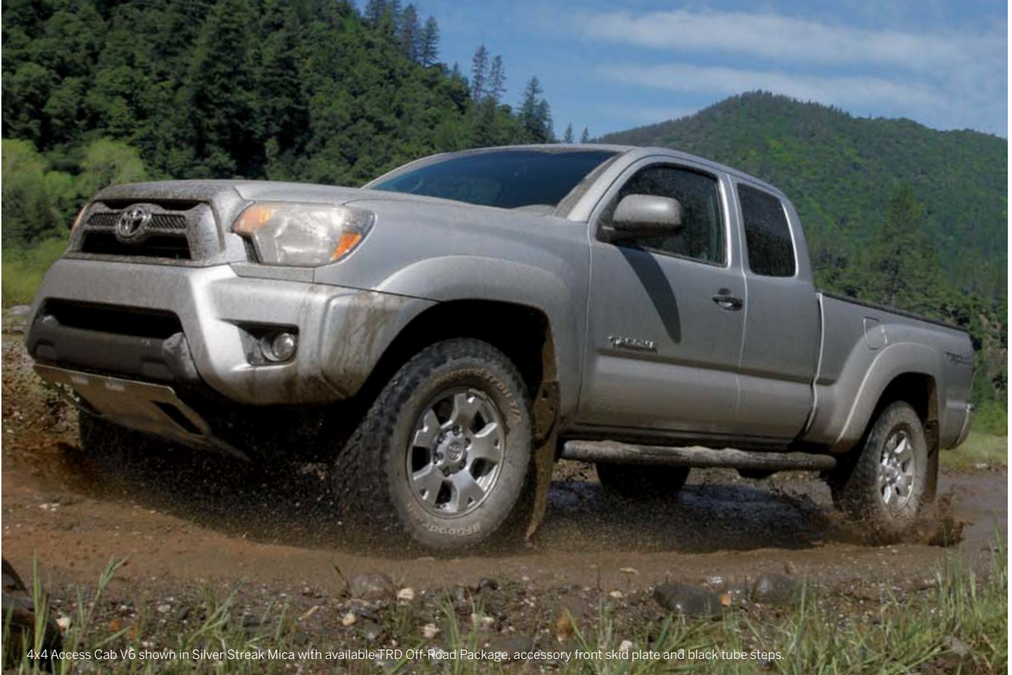
4x4 Access Cab V6 shown in Silver Streak Mica with available TRD Off-Road Package, accessory front skid plate and black tube steps.

Watch out for this one. The 2013 Toyota Tacoma is clearly looking to start something. Like an ATV weekend in the mountains. Or an off-roading trip to the desert. But there's more to this truck than its aggressive new front end. Tacoma is built to finish what it starts. It's forged on massive one-piece frame rails with eight sturdy cross members and a fully boxed front sub-frame. It's got a rugged fiber-reinforced Sheet-Molded Composite (SMC) bed that provides better impact strength than steel. Plus, a leaf spring suspension with staggered outboard-mounted gas shocks. And an available V6 engine with Variable Valve Timing with intelligence (VVT-i) that delivers maximum power on minimum fuel. If you still want to up the ante, it's also got a truckload of extras to choose from: an available TRD Off-Road Package with Bilstein® shocks, 16-in. alloy wheels with P265/70R16 BFGoodrich® tires, Hill Start Assist Control (HAC), 1 Downhill Assist Control (DAC) 2 and an electronically controlled locking rear differential. So, a word to the wise: Try to stay on Tacoma's good side. Get behind the wheel. The 2013 Toyota Tacoma.