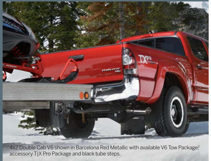
2 ACCESSORY T|X PRO PACKAGE 1