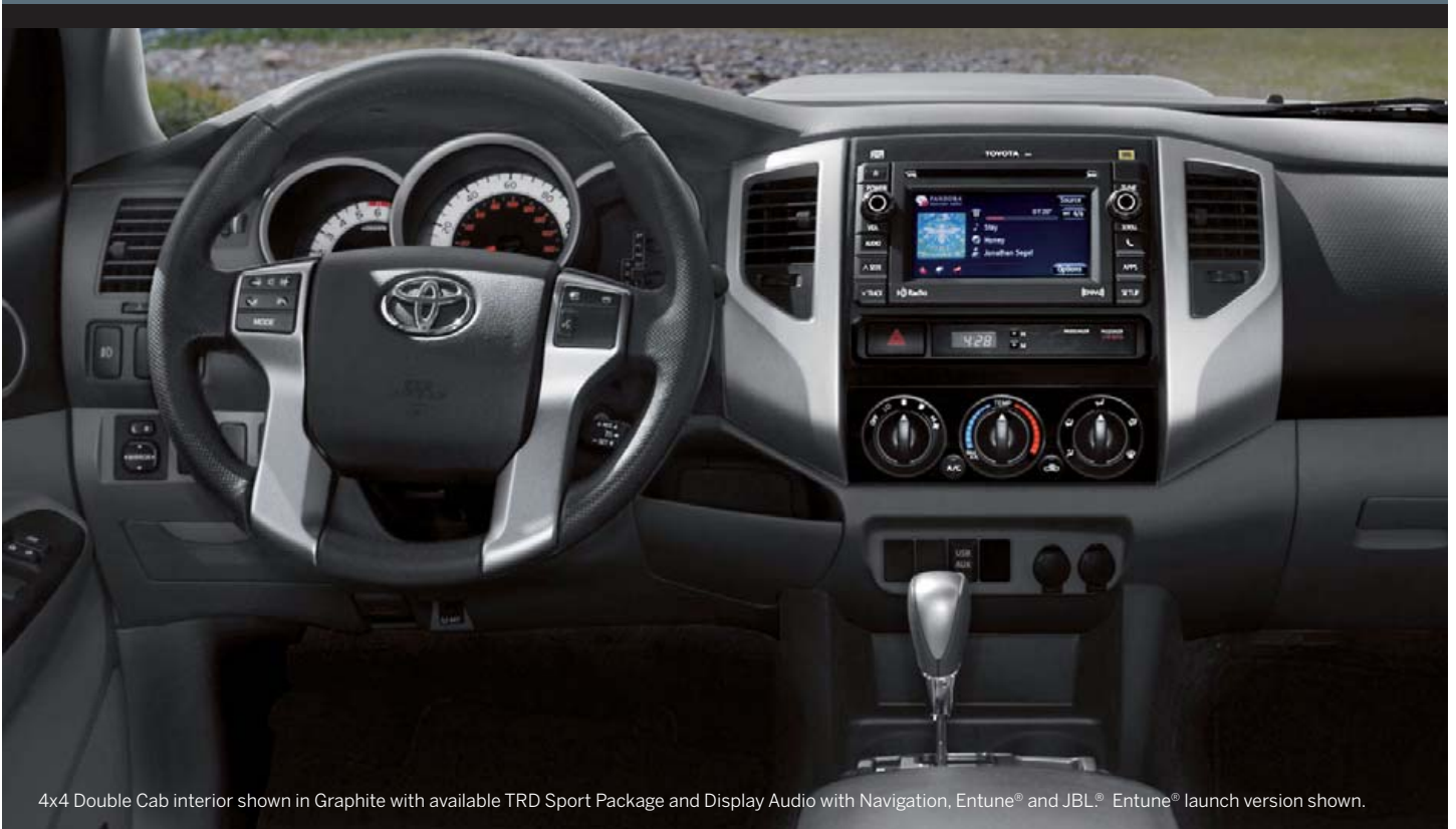
4x4 Double Cab interior shown in Graphite with available TRD Sport Package and Display Audio with Navigation, Entune ® and JBL ® . Entune ® launch version shown.

You'd be hard-pressed to find a compact truck that's more dialed-in than the 2013 Tacoma. Take Tacoma Limited: Inside, you'll find it easy to warm up to, thanks to an available heating feature for the front seats. And the seats are trimmed with SofTex, ® a revolutionary seat material that's more eco-sensitive than leather. Plus, Tacoma hooks you up with available Bluetooth ®1 wireless technology, auxiliary jack, USB port 2 and steering wheel-mounted audio controls. Also available is a rearview mirror that features a 3.3-in. backup monitor, 3 temp gauge, compass and HomeLink ®4 system. Select models offer a premium JBL ® 8-speaker multimedia system with touch-screen navigation 5 and Entune, ®6 Toyota's advanced multimedia system that connects you and your truck with popular mobile applications and data services.