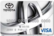
Toyota Rewards Visa®

Toyota helps you get more out of every dollar you spend. By rewarding you for every purchase you make, the Toyota Rewards Visa® adds even more value to doing the things you love.