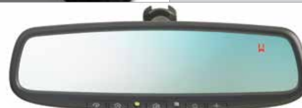
■ Auto-Dimming Mirror with Compass and HomeLink® Mirror automatically darkens when headlights are detected from behind the vehicle. Features an electronic compass with a red transreflective display. Three integrated HomeLink buttons can be programmed to operate most garage door openers and other HomeLink devices. H501SAL100