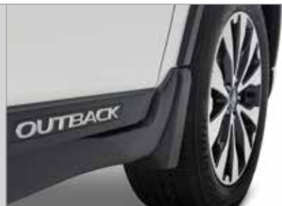
■ Splash Guards Helps protect vehicle paint finish from stones and road grime. J101SAL000 (Set of four)