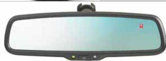
■ Auto-Dimming Mirror with Compass Mirror automatically darkens when headlights are detected from behind the vehicle. Features an electronic compass with a red transreflective display that projects the current direction onto the mirror's surface. H501SAL000