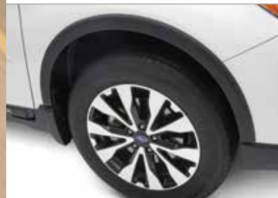
■ Wheel Arch Molding Kit Black textured moldings help protect the wheel arch areas, while adding a rugged, yet classy look. The wheel arch moldings look great with the accessory Splash Guards. E201SAL000 (Set of four)