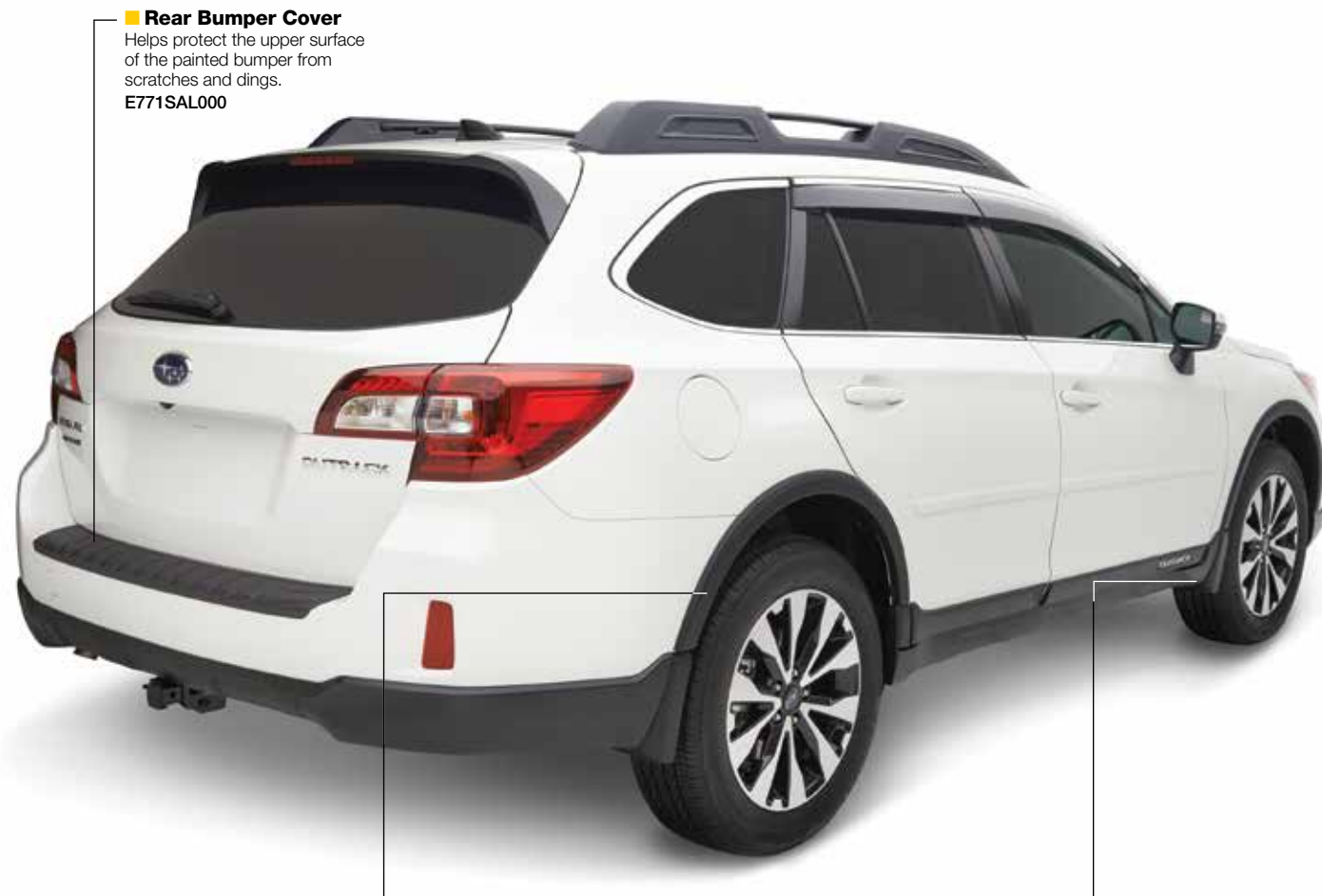
■ Rear Bumper Cover Helps protect the upper surface of the painted bumper from scratches and dings. E771SAL000