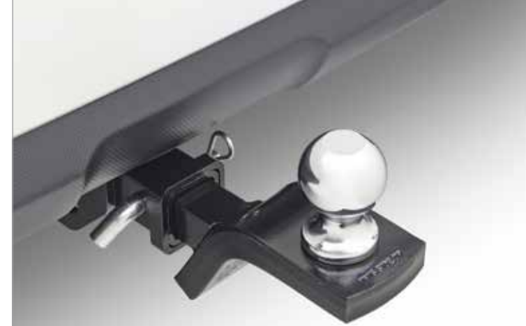
■ Trailer Hitch Subaru hitches are engineered to the same rigorous standards as the rest of your Outback. The hitch is rated at 3,000 lbs. maximum towing capacity with 3.6L engine (2,700 lbs. maximum with 2.5L engine) and 200 lbs. maximum tongue weight. L101SAL011 Hitch ball not included. Trailer brakes may be needed. Not compatible with Rear Bumper Underguard.