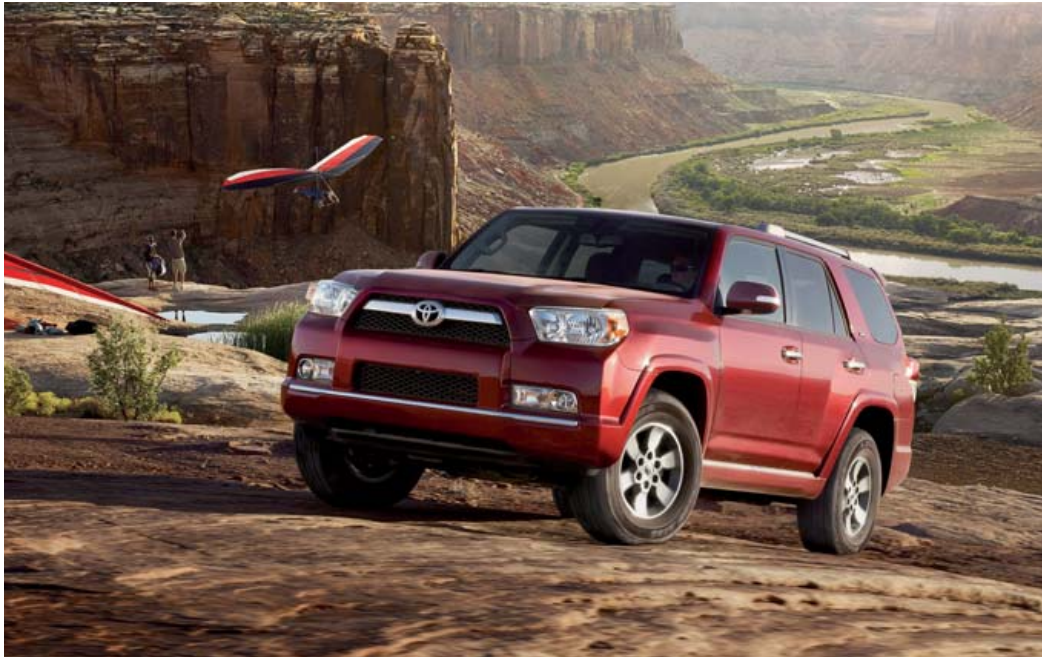
SR5 4x4 shown in Salsa Red Pearl with available accessory roof rail cross bars.