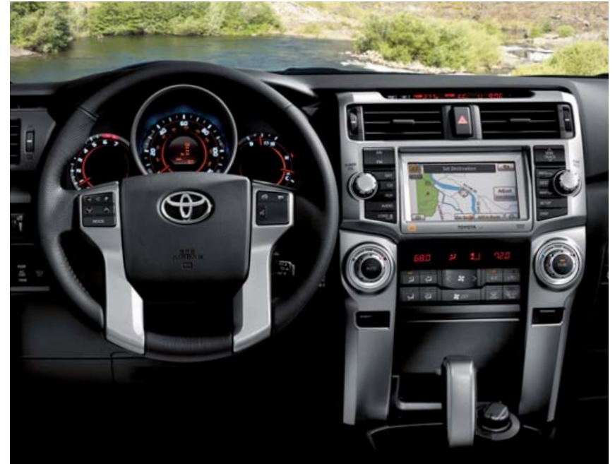
Limited 4x4 interior shown in Sand Beige with available voice-activated touch-screen DVD navigation system!

For some, the path to self-discovery is an unpaved road. It's for these intrepid souls that the 2012 Toyota 4Runner was designed. With its reinforced body-on-frame construction, 4Runner is always ready for rugged adventure. And now, J.D. Power and Associates has named 4Runner the "Most Dependable Midsize Crossover/SUV." 2 It's no wonder that over 80% of 4Runners sold in the last ten years are still on the road. 3 So the only question is: You in? 2012 Toyota 4Runner. Moving Forward.