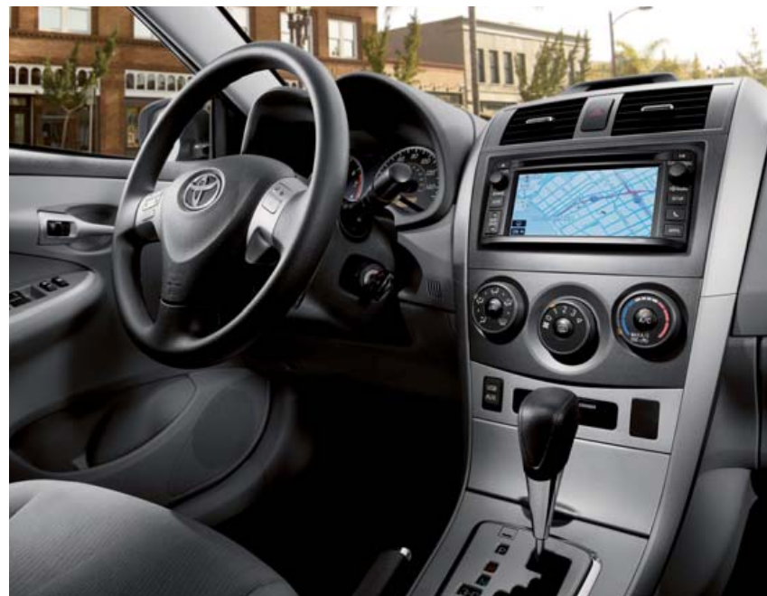
LE interior shown in Ash with available Display Audio with Navigation 1 and Entune TM2 .

They say practice makes perfect. And considering the millions of Corollas we've sold since introducing it way back in 1968, it's fair to say that we've had a lot of practice. It's no mystery: The 2012 Corolla offers the ideal blend of comfort, value and safety. In it, you'll find a surprising number of high-end features. It offers remarkable performance and fuel efficiency, plus an impressive list of standard safety features. Factor in its legendary reliability, and it's clear that Corolla is the smart choice. 2012 Toyota Corolla. Moving Forward.