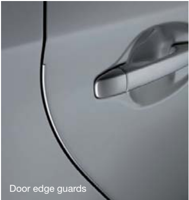
Door edge guards