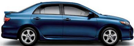
NAUTICAL BLUE METALLIC