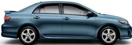
TROPICAL SEA METALLIC