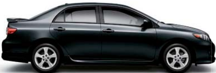
BLACK SAND PEARL