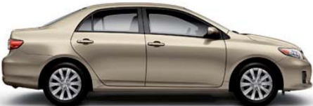
SANDY BEACH METALLIC