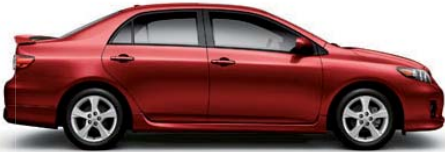
BARCELONA RED METALLIC