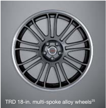
TRD 18-in. multi-spoke alloy wheels 25