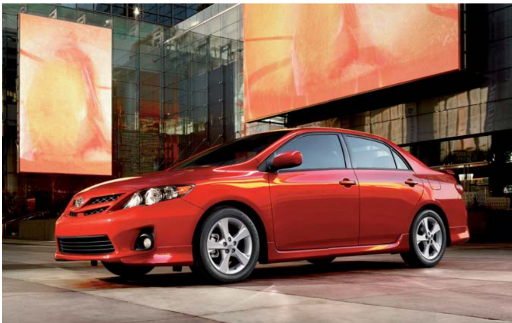
S shown in Barcelona Red Metallic.