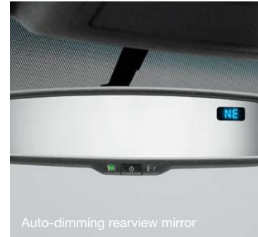
Auto-dimming rearview mirror