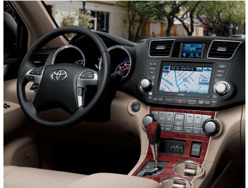
Limited interior shown in Sand Beige with available voice-activated touch-screen navigation system 1 .

Life can be filled with challenges. Happily, the 2012 Toyota Highlander is filled with solutions. For starters, it seats up to seven. And with a 50/50 split fold-flat third-row seat and a second-row Center Stow™ system, it's remarkably versatile. It provides an array of standard safety features, including the Star Safety System™ and seven airbags 2 . There's a host of thoughtful features, like an available power liftgate and Smart Key System. 3 But Highlander shines especially brightly when it's filled with one thing in particular: your family. 2012 Toyota Highlander. Moving Forward.