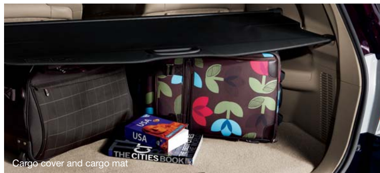
Cargo cover and cargo mat