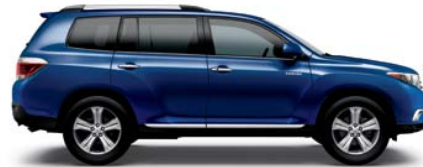
NAUTICAL BLUE METALLIC 1