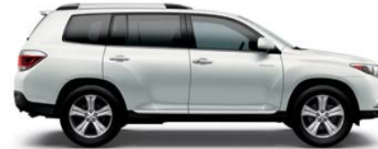
BLIZZARD PEARL 3