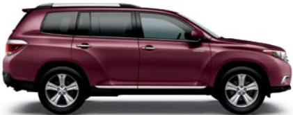
SIZZLING CRIMSON MICA