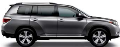
MAGNETIC GRAY METALLIC 1