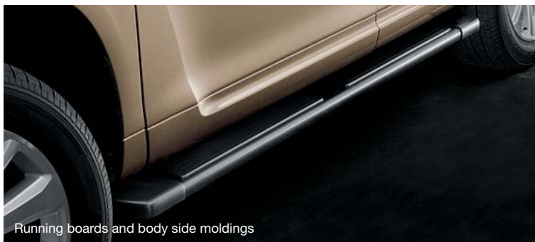
Running boards and body side moldings