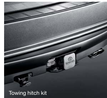
Towing hitch kit