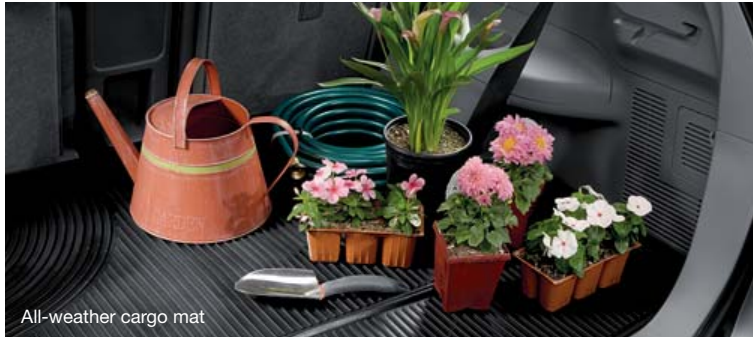
All-weather cargo mat

A wide range of Genuine Toyota Accessories is available to help you make your Highlander your own. Considering how appealing Highlander is to begin with, these high-quality products will be like icing on the cake. Some accessories may not be available in all regions of the country. See your Toyota dealer for details.