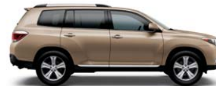
SANDY BEACH METALLIC 1