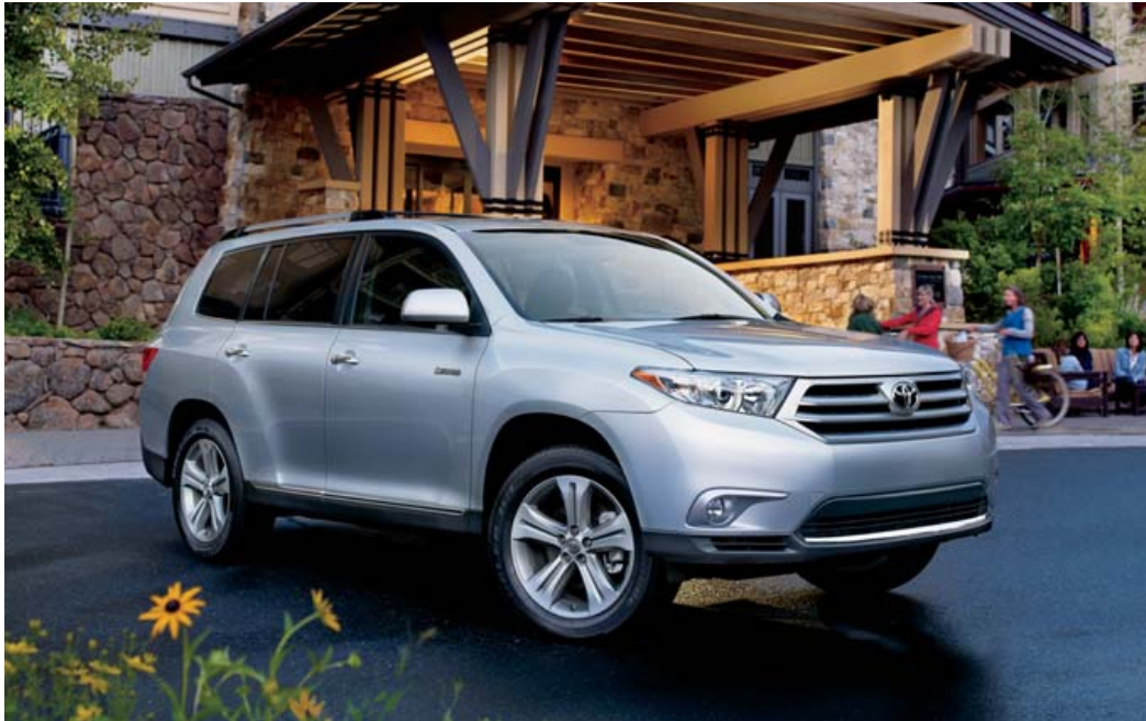
Limited shown in Classic Silver Metallic with available accessory roof rail cross bars.