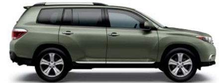
CYPRESS PEARL 1