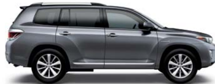
PREDAWN GRAY MICA 2