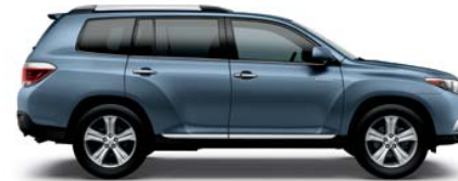
SHORELINE BLUE PEARL