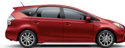
BARCELONA RED METALLIC