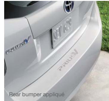
Rear bumper appliqué