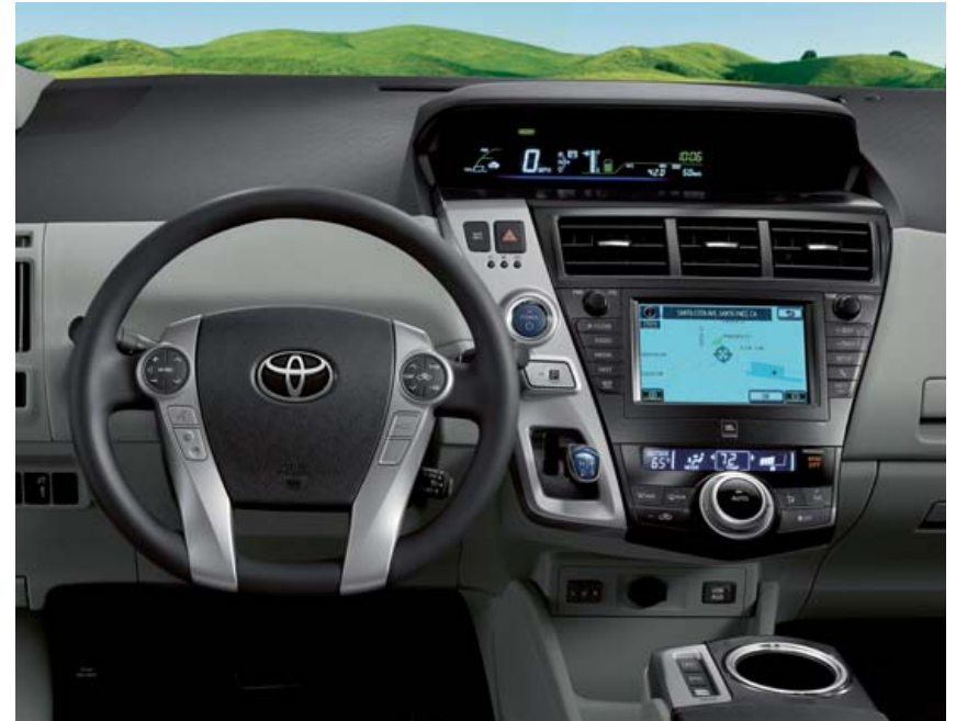
Prius v Five interior shown in Misty Gray SofTex with available Advanced Technology Package.

No, your eyes do not deceive you: That's the iconic and highly aerodynamic shape of the Toyota Prius, only bigger. It's the 2012 Prius v, a new addition to the Prius Family offering all the proven benefits of Prius, plus lots of added cargo volume. With the highest combined fuel efficiency of any SUV, crossover utility vehicle or wagon, 1 a Super Ultra Low Emission Vehicle (SULEV) rating 2 and loads of versatile features everywhere, it looks like the future is shaping up nicely. 2012 Toyota Prius v. Moving Forward.