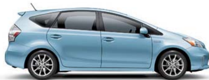
CLEAR SKY METALLIC