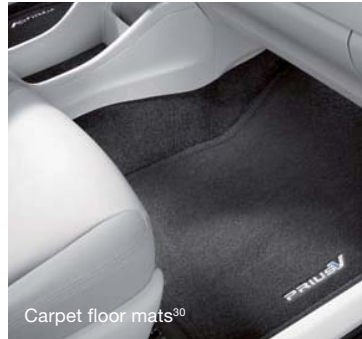
Carpet floor mats 30

Alloy wheel locks All-weather floor mats 30 Ashtray cup Cargo net Cargo tote Carpet floor mats 30 Emergency assistance kit First aid kit Folding carpeted cargo mat Hybrid Synergy Drive ® window sticker Mudguards Paint protection film Rear bumper appliqué Remote Engine Starter VIP Security — Glass Breakage Sensor (GBS) 31