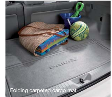
Folding carpeted cargo mat