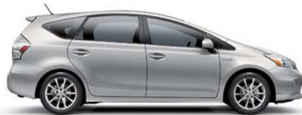
CLASSIC SILVER METALLIC