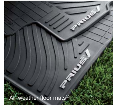
All-weather floor mats 30