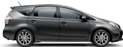
MAGNETIC GRAY METALLIC