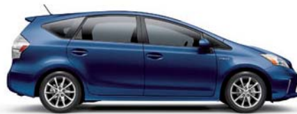
BLUE RIBBON METALLIC