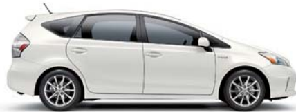
BLIZZARD PEARL (extra-cost color)