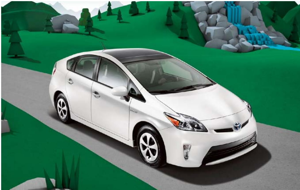
Prius Four shown in Blizzard Pearl with available Deluxe Solar Roof Package!