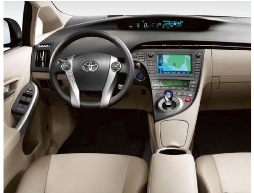
Prius Four interior shown in Bisque SofTex trim with available Deluxe Solar Roof Package!

The 2012 Toyota Prius has demonstrated that there can be harmony between man, nature and machine. Prius has also shown that there can be consensus among many different types of drivers. Those who demand fuel efficiency, and those who like to take the fast lane. Those intrigued by advanced technology, and those who want proven reliability. Those interested in reducing their carbon footprint, and those hesitant to sacrifice practicality in order to do it. With all that Prius has to offer, it may be the one vehicle we can all agree on. 2012 Toyota Prius. Moving Forward.