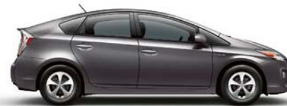
WINTER GRAY METALLIC