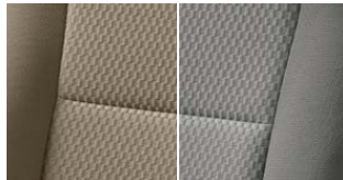
SR5 fabric in Sand Beige or Graphite