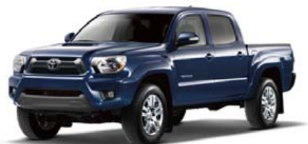
TRD Sport Upgrade Package