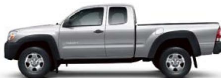
SILVER STREAK MICA