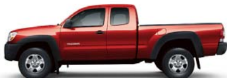
BARCELONA RED METALLIC