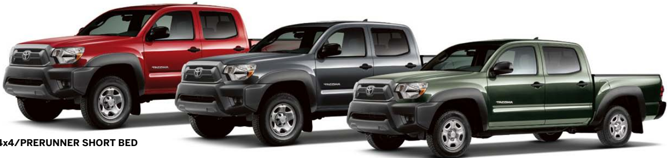
4x4/PRERUNNER SHORT BED