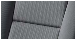
Base Grade fabric in Graphite