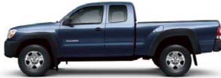
NAUTICAL BLUE METALLIC (available with Graphite interior only)