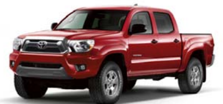
TRD Off-Road Package