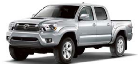
TRD Sport Package