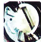
Clean Throttle Body