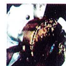
Dirty Throttle Body

The light turns green, you depress the accelerator, and your vehicle... stalls. You are frustrated, and so are the motorists blaring their horns behind you! If your vehicle is experiencing stalling or hesitation, it is likely due -- at least, in part -- to improper maintenance of the throttle body. In today's fuel injected engines, the throttle body is a device that controls the amount of air flow to the engine. Over time, dirt and gum can gradually accumulate in the throttle body. A portion of this debris is airborne dirt that makes its way through the air filter, but most of it results from oil and combustion gases coming from the engine as the intake valves open and close. As part of our Complete Throttle Body Service, one of our skilled Technicians will thoroughly clean the throttle body using highly specialized chemicals. This cleaning will protect the throttle body and ensure that it works in proper unison with the intake valves and fuel injectors.