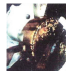
Dirty Throttle Body

The light turns green, you depress the accelerator, and your vehicle... stalls. You are frustrated, and so are the motorists blaring their horns behind you! If your vehicle is experiencing stalling or hesitation, it is likely due -- at least, in part -- to improper maintenance of the throttle body. In today's fuel injected engines, the throttle body is a device that controls the amount of air flow to the engine. Over time, dirt and gum can gradually accumulate in the throttle body. A portion of this debris is airborne dirt that makes its way through the air filter, but most of it results from oil and combustion gases coming from the engine as the intake valves open and close. As part of our Complete Throttle Body Service, one of our skilled Technicians will thoroughly clean the throttle body using highly specialized chemicals. This cleaning will protect the throttle body and ensure that it works in proper unison with the intake valves and fuel injectors.