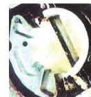
Clean Throttle Body