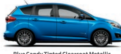
Blue Candy Tinted Clearcoat Metallic