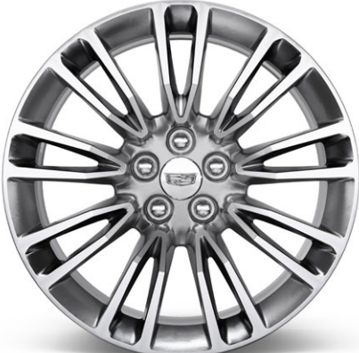
20" ULTRABRIGHT MACHINED ALUMINUM MULTI-SPOKE WITH MANOOGIAN SILVER POCKETS

Standard on CT6 Luxury and Premium Luxury AWD models. Available on Luxury RWD models.