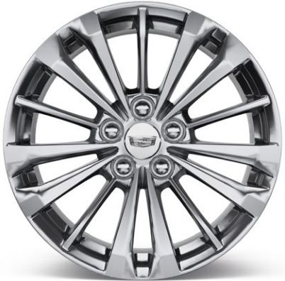
18" MULTI-SPOKE ALUMINUM WITH BLADE SILVER PAINTED FINISH

Some standard content may be deleted with fleet orders. See dealer for details.