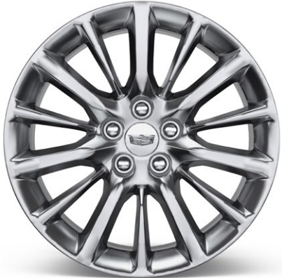
19" MULTI-SPOKE ALUMINUM WITH STERLING SILVER PREMIUM PAINTED FINISH

Standard on CT6 AWD models. Available on CT6 RWD models.