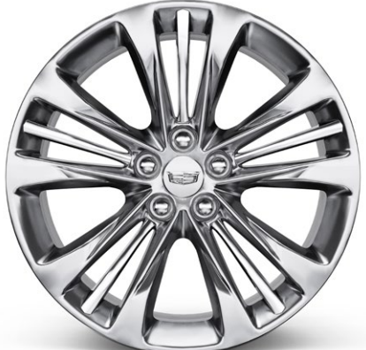
20" 5-SPLIT SPOKE ALUMINUM WITH MANOOGIAN SILVER PREMIUM PAINTED FINISH AND 5 CHROME INSERTS

Available on CT6 Luxury and Premium Luxury AWD models.