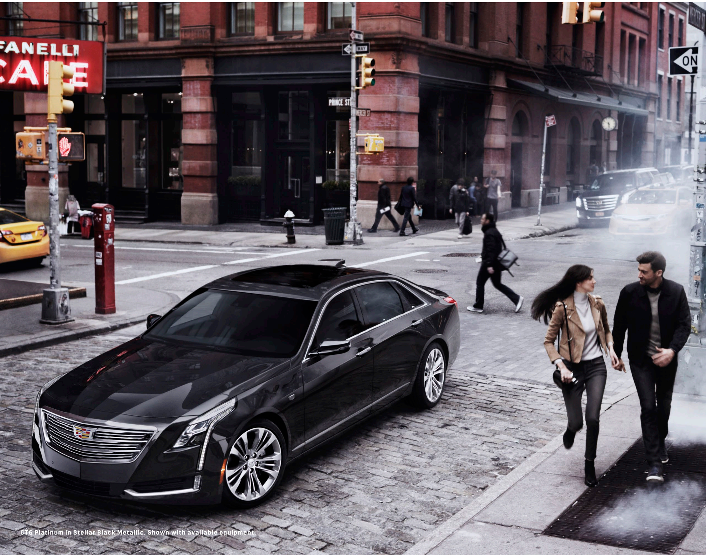
CT6 Platinum in Stellar Black Metallic. Shown with available equipment.