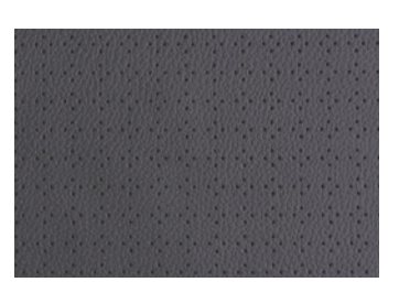
GREY LEATHER Available on 3.3L Luxury and 3.3L Limited models (Circuit Silver and Becketts Black exterior colours only).