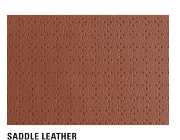
Available on 3.3L Limited 6-passenger model only (Monaco White, Becketts Black and Iron Frost exterior colours only).

Choice of interior colour depends upon model and/or exterior colour selection. Due to the print production process, the colours and textures shown throughout this brochure may not be exactly as shown. Visit hyundaicanada.com or see your dealer for details.