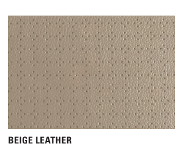
Available on 3.3L Luxury and 3.3L Limited models (Monaco White, Becketts Black and Regal Red Pearl exterior colours only).