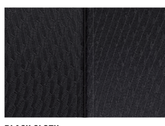
BLACK CLOTH With YES Essentials® stain protectant. Standard on 3.3L Premium model.