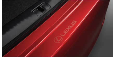
Rear Bumper Appliqué $114.10*

Genuine Lexus paint protection film, designed for the hood and front fenders, helps guard your vehicle from weathering, UV radiation and road debris that can chip and scratch the finish. Constructed from durable, nearly invisible thermoplastic urethane, the clear-coated film helps your Lexus maintain a like-new appearance, while allowing you to clean and maintain your vehicle the same as before. Backed by a 7 year limited warranty. At participating dealers only.