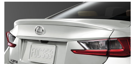
Rear Spoiler $492.00*

Heighten the thrill of stepping into your Lexus with illuminated door sills for the driver and front passenger doors. Precision-contoured to fit the vehicle, the sills feature brushed heavy-gauge stainless steel to help protect against unsightly scuffs, scrapes and scratches. The front door sills feature LED illumination of the Lexus name in glowing white whenever the front doors are opened. These illuminated door sill enhancements are designed to meet Lexus' high standards for precision fit and finish, so you can be assured of long-lasting beauty and durability.