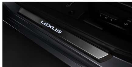
Illuminated Door Sill Protectors $546.00*

Custom designed for your Lexus providing 400 watts of heating power. Provides easy cold weather starts reducing engine wear. Provides faster interior warm-up. Includes a 'strain relief' electrical cord.