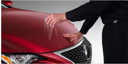
Paint Protection Film $580.50*

Genuine Lexus paint protection film, designed for the hood and front fenders, helps guard your vehicle from weathering, UV radiation and road debris that can chip and scratch the finish. Constructed from durable, nearly invisible thermoplastic urethane, the clear-coated film helps your Lexus maintain a like-new appearance, while allowing you to clean and maintain your vehicle the same as before. Backed by a 7 year limited warranty. At participating dealers only.