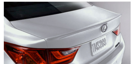
Rear Spoiler $497.00*

Stray shopping carts take note. Sleek and amazingly durable, Lexus body-side moldings feature a high-quality body-color finish and are rigorously tested in extreme climates for impact and chip resistance. They're also designed to resist peeling in high-pressure washing and normal environmental exposure. By helping to protect the door from scratches, dents and chipping, this premium accessory helps retain the vehicle's resale value.