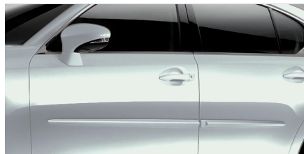
Body Side Moulding $228.50*

Custom designed for your Lexus providing 400 watts of heating power. Provides easy cold weather starts reducing engine wear. Provides faster interior warm-up. Includes a 'strain relief' electrical cord.