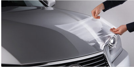
Paint Protection Film $580.50*

Genuine Lexus paint protection film, designed for the hood and front fenders, helps guard your vehicle from weathering, UV radiation and road debris that can chip and scratch the finish. Constructed from durable, nearly invisible thermoplastic urethane, the clear-coated film helps your Lexus maintain a like-new appearance, while allowing you to clean and maintain your vehicle the same as before. Backed by a 7 year limited warranty. At participating dealers only.