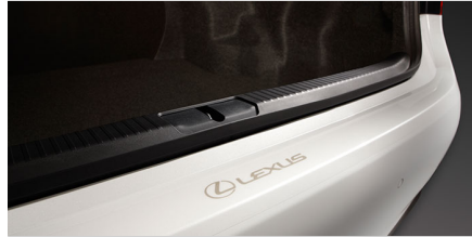
Rear Bumper Appliqué $114.10*

Genuine Lexus paint protection film, designed for the hood and front fenders, helps guard your vehicle from weathering, UV radiation and road debris that can chip and scratch the finish. Constructed from durable, nearly invisible thermoplastic urethane, the clear-coated film helps your Lexus maintain a like-new appearance, while allowing you to clean and maintain your vehicle the same as before. Backed by a 7 year limited warranty. At participating dealers only.