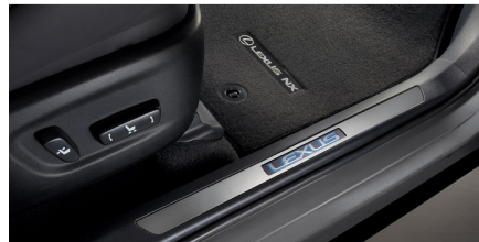
Illuminated Door Sill Protectors $492.90*

Includes a 'strain relief' electrical cord.