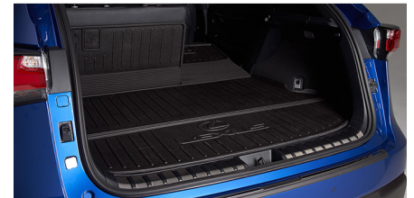
Seatback Cargo Liner $184.40*

Heighten the thrill of stepping into your Lexus with illuminated door sills for the driver and front passenger doors. Precision-contoured to fit the vehicle, the sills feature brushed heavy-gauge stainless steel to help protect against unsightly scuffs, scrapes and scratches. The front door sills feature LED illumination of the Lexus name in glowing white for gas models or hybrid blue for hybrid models whenever the front doors are opened. These illuminated door sill enhancements are designed to meet Lexus' high standards for precision fit and finish, so you can be assured of long-lasting beauty and durability.