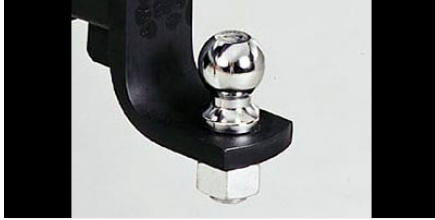
Trailer Hitch Ball - 2" $31.70*

Hitches and Accessories have been designed specifically for your vehicle. Please consult your Lexus Dealer for vehicle specific information.