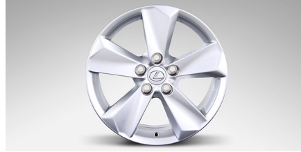
17" Winter Alloy Wheels (5 Spoke) $1,424.60*

* Notes: Trailer Ball Platform sold separately.