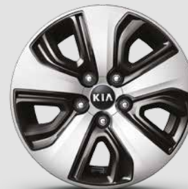
16" alloy wheels with wheel covers