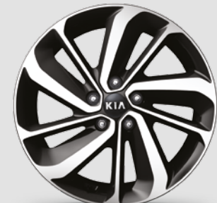
18" alloy wheels