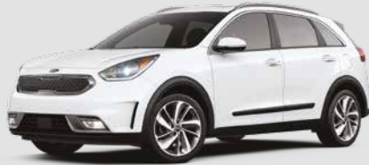
Snow White Pearl