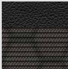
Black cloth and leather combination