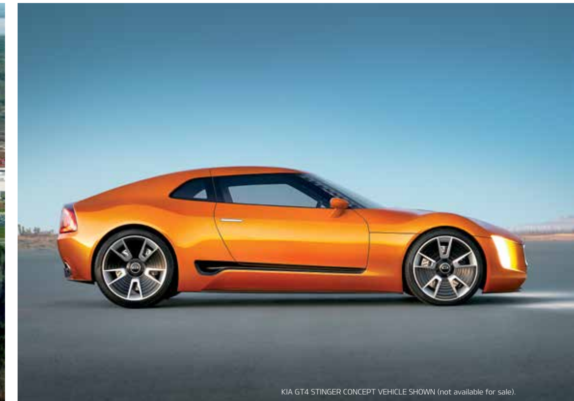
KIA GT4 STINGER CONCEPT VEHICLE SHOWN (not available for sale).