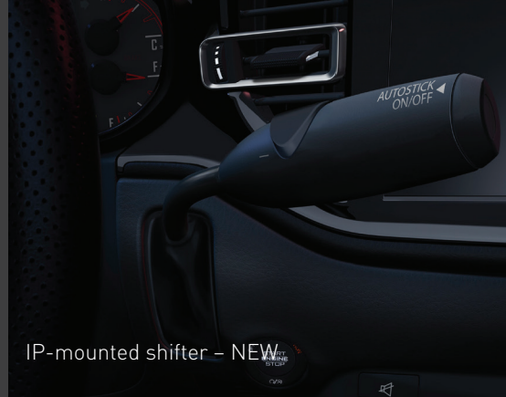
IP-mounted shifter – NEW