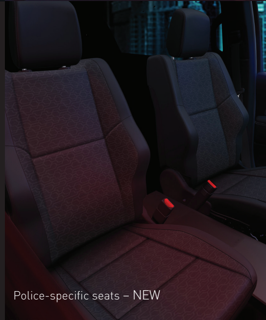
Police-specific seats – NEW