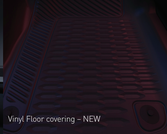
Vinyl Floor covering – NEW