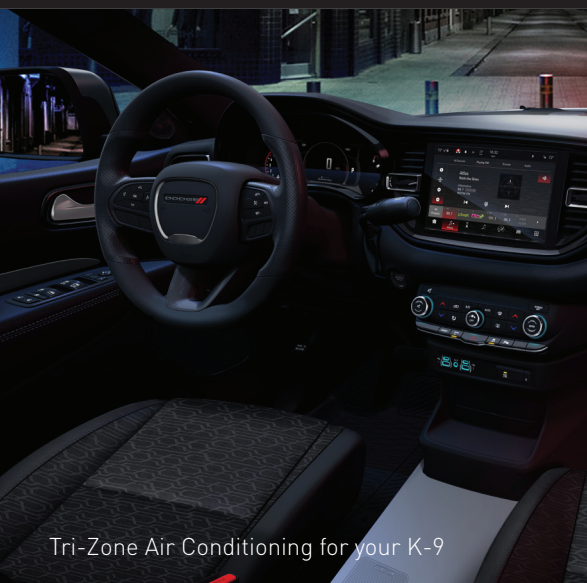
Tri-Zone Air Conditioning for your K-9