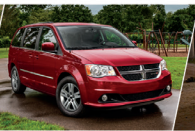
Dodge Grand Caravan