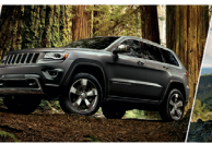
Jeep® Grand Cherokee