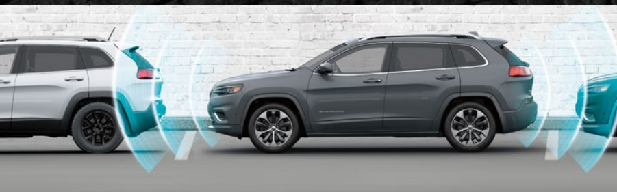
Forward Collision Warning with Active Braking<sup>7</sup> detects fast approaches and provides alerts and brake assistance if the driver does not react in time. Available.