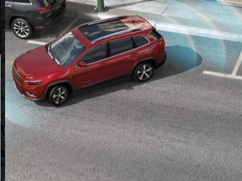
Parallel and Perpendicular Park Assist<sup>7</sup> actively guides steering to help you ease into parking spots. Available.