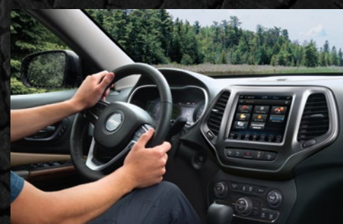
Advanced technology aids safe travel, including available 4G Wi-Fi<sup>5*</sup> and SiriusXM Guardian?