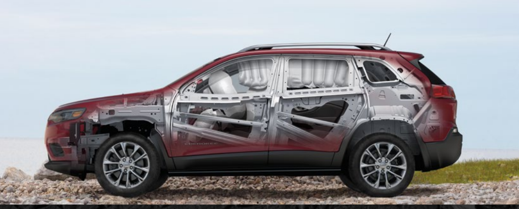
Enhancements to the safety cage and the body and door structures help provide front passengers with reassuring security during side-impact events.