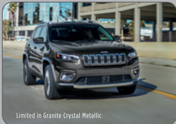
Limited in Granite Crystal Metallic

4G WI-FI 6 HOTSPOT All along the way, you can upload and download, post, and search. Uconnect with available Wi-Fi 6 links compatible devices to the Web so passengers can stay connected.