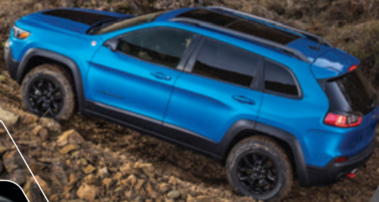
Trailhawk® in Hydro Blue Pearl

ROCK delivers Trail Rated® 4WD Low capability thanks to its locking rear differential, allowing you to crawl over rugged terrain at appropriately safe speeds. Standard on Trailhawk.